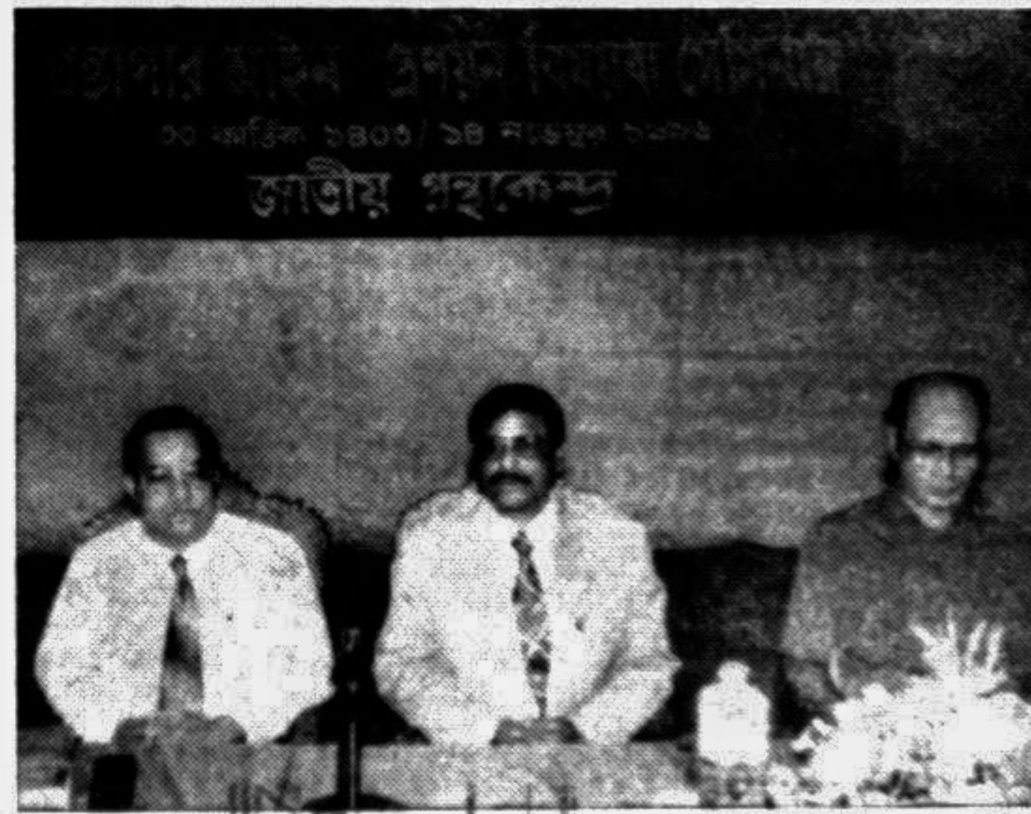
A seminar on library legislation in Bangladesh was organised in the city yesterday.

The discussants urged the government to promulgate and implement the 'Library Act' and to set up an autonomous body for the proper functioning of the Act.