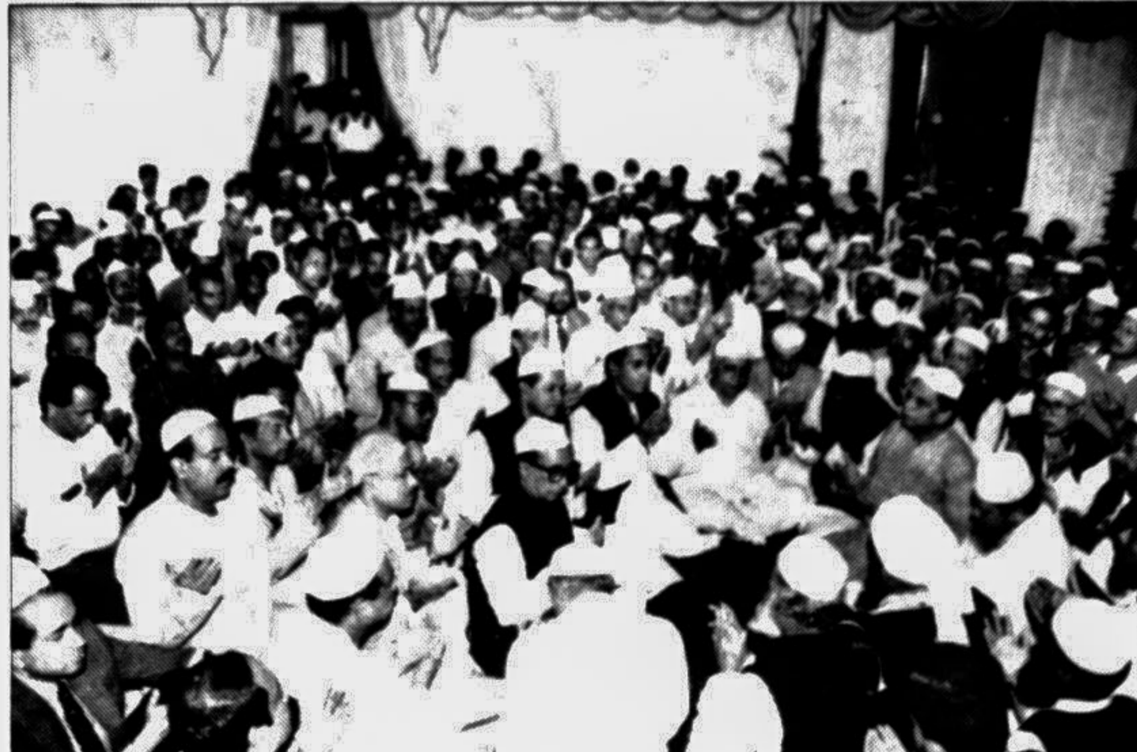
Awami League arranged a milad mahfil at Ganobhaban yesterday evening expressing gratitude to the Almighty for passage of the Indemnity (Repeal) Bill in Parliament on Tuesday.