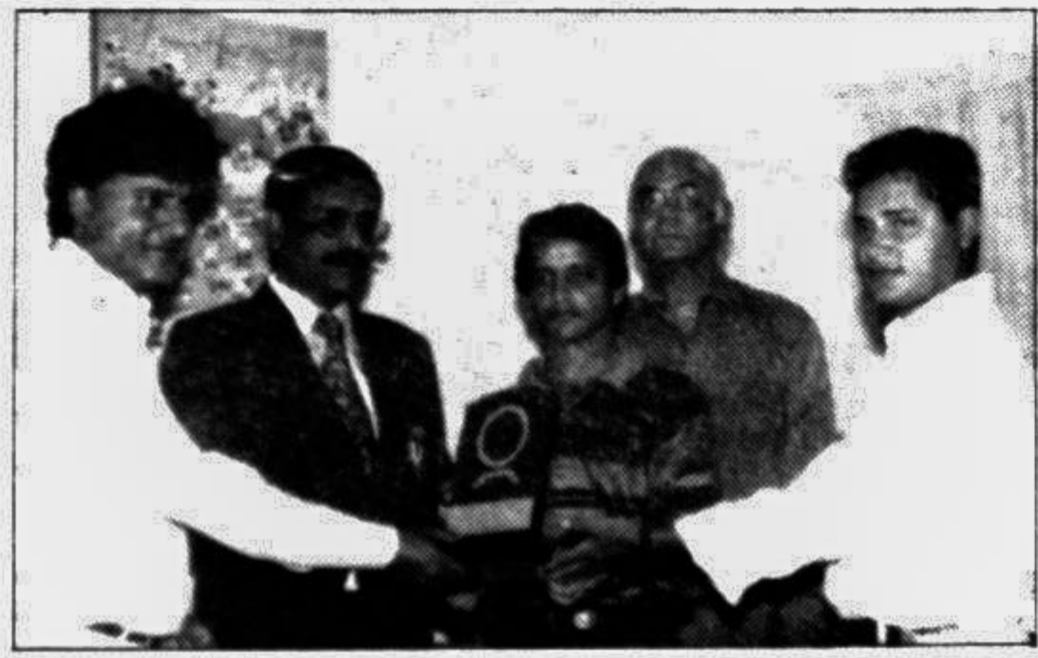
Officials of Bangladesh Sports Journalists and Writers Community presenting a crest to State Minister for Youth and Sports Obaidul Quader at the BSJWC office at the Dhaka Stadium yesterday.

Meanwhile, Log area, Rangpur area, Bogra area and Savar area won their respective matches on Tuesday.