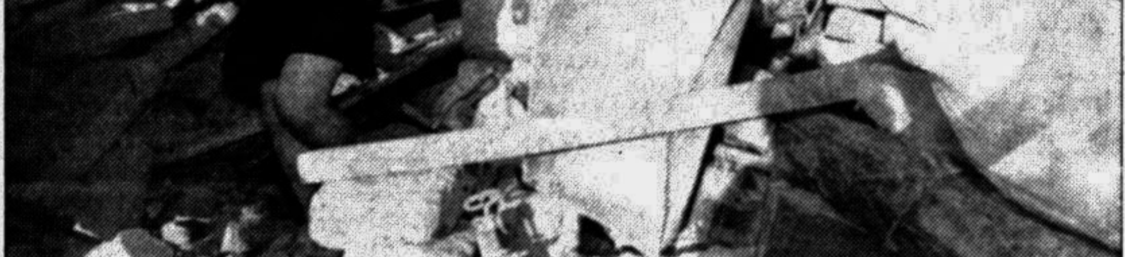
A girl walks through the rubble of a building in Nazca, Peru, 300 miles south of Lima Tuesday after an earthquake measuring 7.3 on the Richter scale struck the town. 15 people are reported dead and 120 injured.

Criticism of the embargo has heightened since the US passed its HELMS-Burton Act earlier this year, allowing American citizens who were Cuban nationals before the 1959 revolution to sue foreign companies or individuals who are using property confiscated by the government of President Fidel Castro.