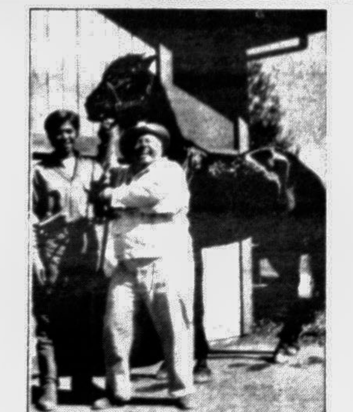
The Adventure of Black Stallion on Star Plus. Today at 5:30 pm

6:00am Live Master Card Grand Slam of Golf Final Day From Hawaii USA 10:00 Spanish Fball League HL 10:30 International Motorsports News 11:30 Asia Road Racing Champs Philippines 12:00 Watersports World-8 2:30 Gulf Cup Match 4: UAE vs Saudi Arabia 4:00 Mumm 36-Wld Champs 4:30 Trans World Sport 5:30 International Motorsports News 4:00 Prime Boxing 5:30 Futbol Mundial