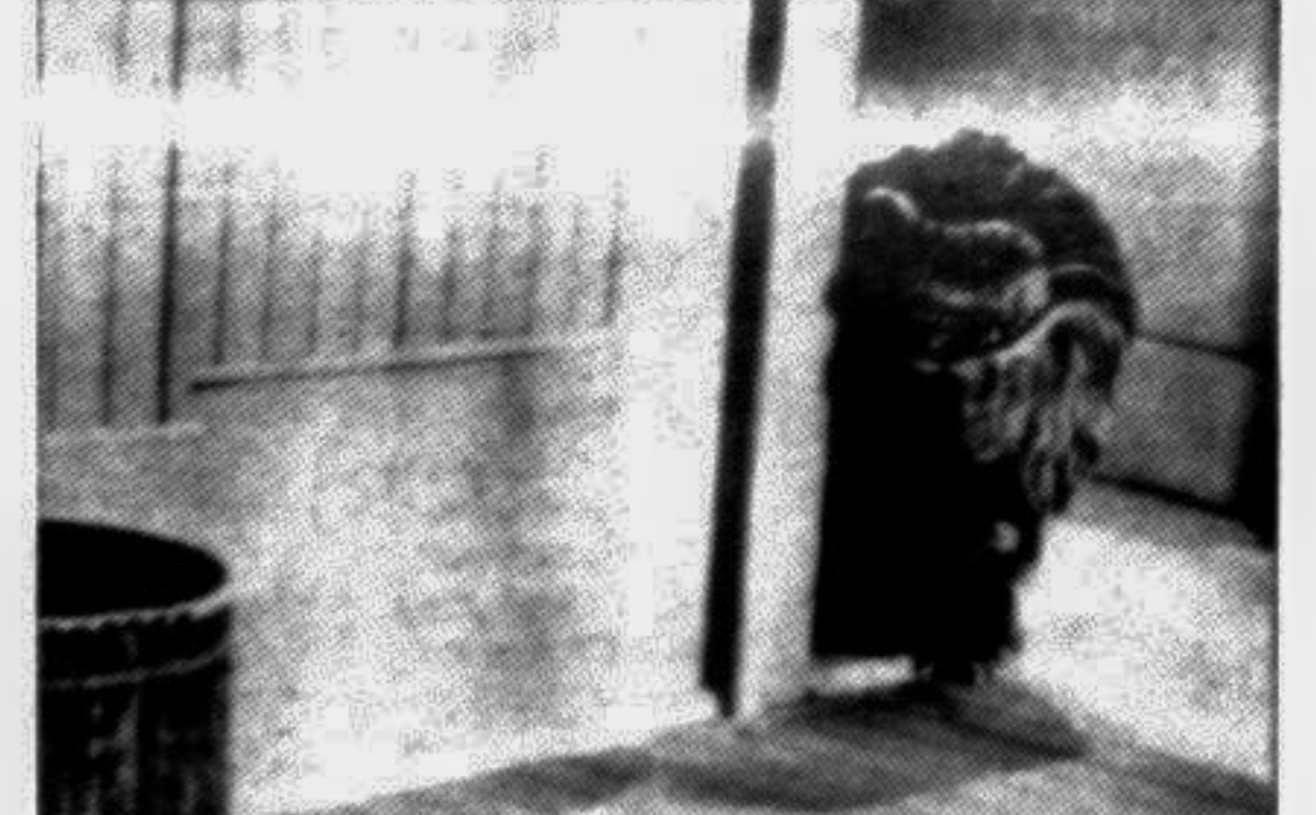
Critters III on Star Movies. Tonight at 1:30