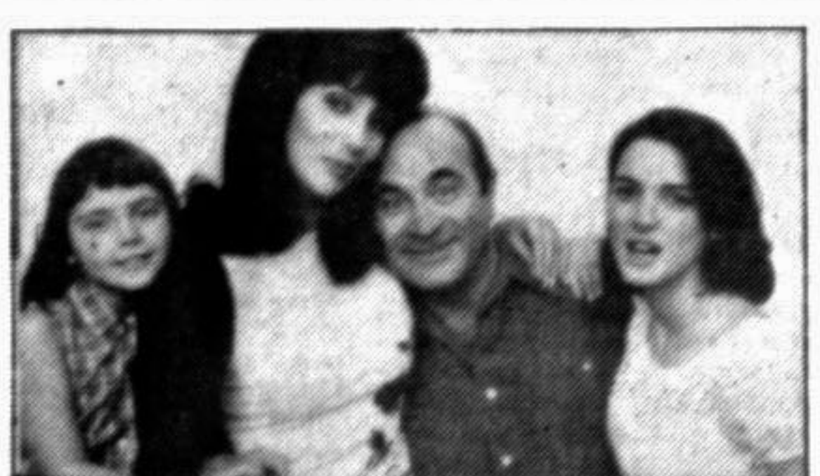
Double bill : Bob Hoskins on Star Movies, Mermaids (Above) at 7:30PM & Heart Condition (Bottom) at 9:30PM

6:00am Live Masters Card Grand Slam of Golf Day 3 from Hawaii, USA 10:30 Spark 11:00 Live Singer Champions Trophy 1996 New Zealand vs Pakistan From Sharjah, UAE 2:30 Cricket Hall Of Fame 3:00 Lunch 3:30 Live Singer Champions Trophy 1996 New Zealand vs Pakistan From Sharjah, UAE 7:00 Gillette World Sports Special 7:30 Asia