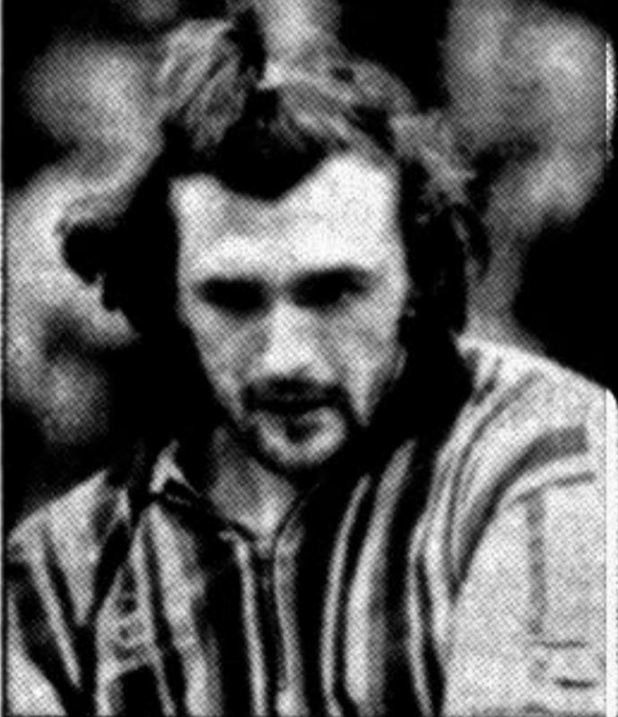
Goran Ivanisevic (Croatian tennis star)

"Last year I shaved my head, lost in the first round and had my ears frozen. This time I decided to change my hair style and look what happened."