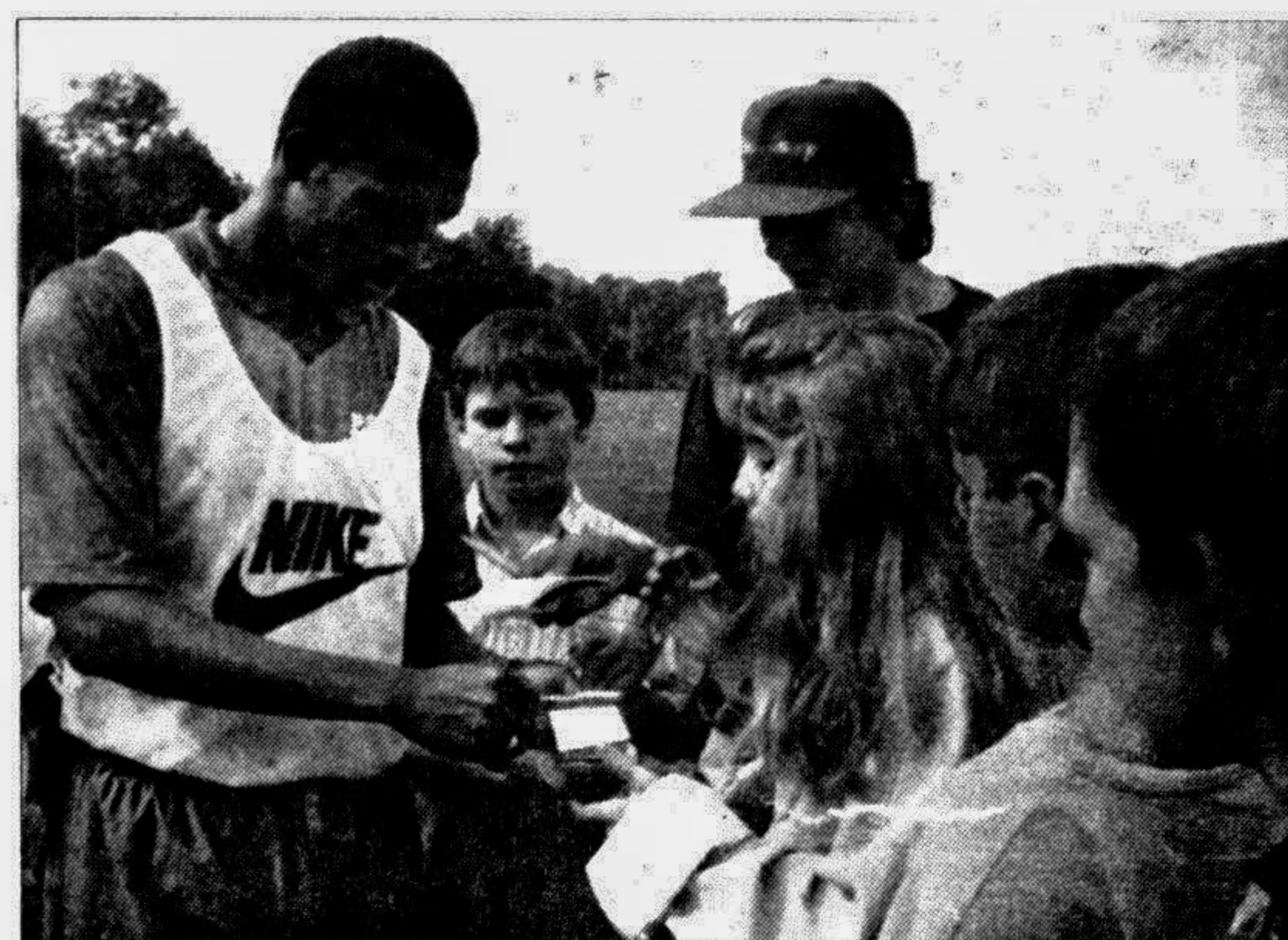
FIFA footballer-of-the-year George Weah (L) signing autographs for children of victims of a stand that collapsed at a stadium in May in Bastia, outside Paris. FIFA awarded Weah it's fair play award in Zurich on Nov 8.

The 19-year-old defending champion, eighth in the ATP Tour, crushed his competitor 6-2, 6-0 in just 48 minutes at the Kundliga Hall to earn a weekend match against either Greg Rusedski or Thomas Johansson.