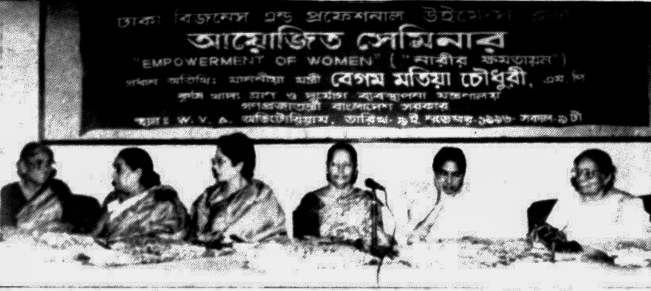
Discussions at a seminar on 'empowerment of women' organised by Dhaka Business and Professional Women's Club at the WVA auditorium in the city yesterday.

MICROCEL B-175, Lane-23, New DOHS, Mohakhali, Dhaka. Phone : 872757, 873137, 872684 Fax : 883422