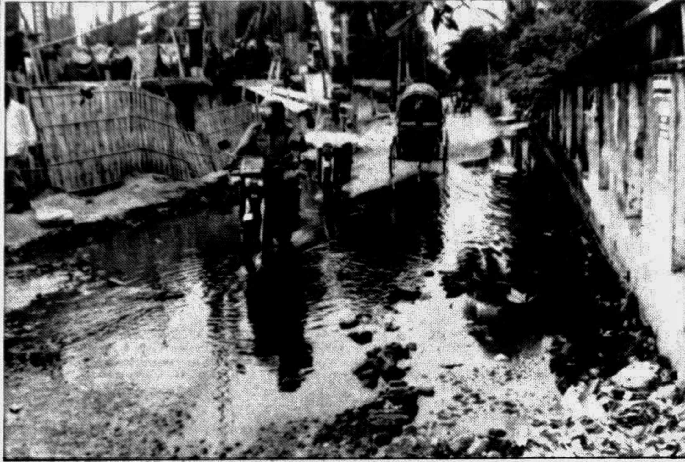
Pitiable condition of Circuit House Road.

Circuit House Road used to be a very tranquil, homely street even as recently as two years ago. It was clean, free of noise and traffic congestion. Residents never had to face any shortfall in water supply, nor was there ever frequent power failures and fluctuations like some other parts of the capital. However, in the past couple of years a lot has changed and all for the worse. There are six more multi-storied apartment complexes on the same street this year, home to about 80 new households. More are on the way since several plots along the road are in the process of development. Most of the old residents have given up their family homes to make way for newer and higher columns of concrete to be built. This is easily the street with the highest number of housing complexes in the city now. But with all the development, in the race for profits, the area has been reduced to just a shadow of its former self.