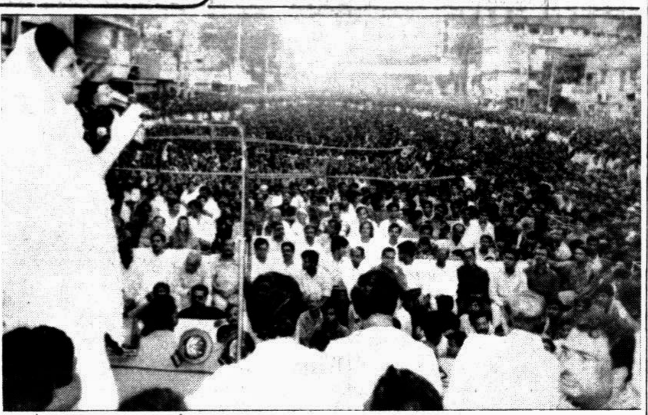
Leader of the Opposition and BNP chief Begum Khaleda Zia addressing a public meeting in front of the party central office in the city Thursday marking November 7.