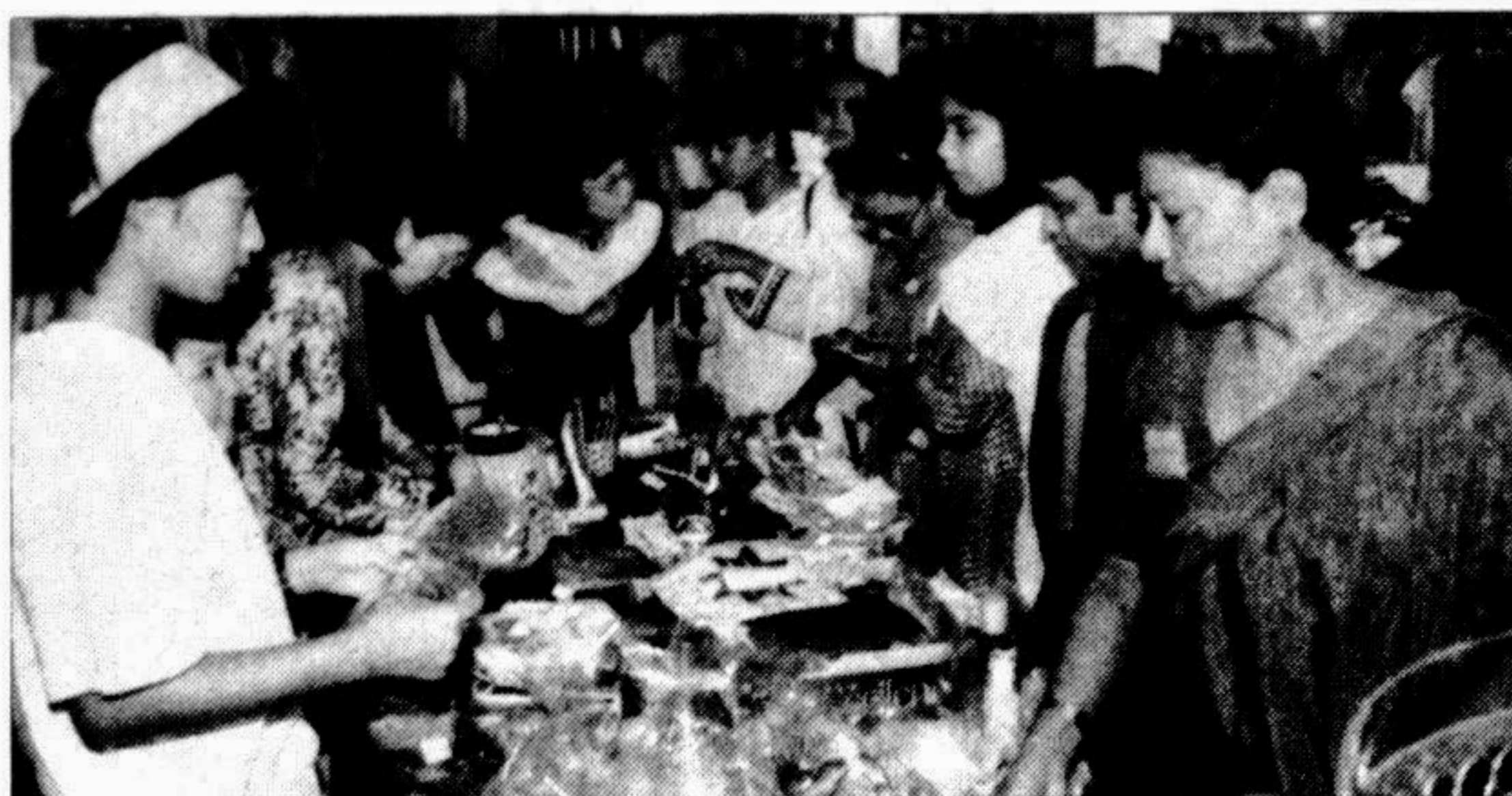
Visitors at a hemanta mela (autumn fair) organised by Bangladesh Federation of University Women at the Dhaka Business and Professional Women's Club yesterday.