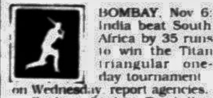
TENDULKAR ... 67

BOMBAY, Nov 6: India beat South Africa by 35 runs to win the Titan triangular one-day tournament on Wednesday report agencies.