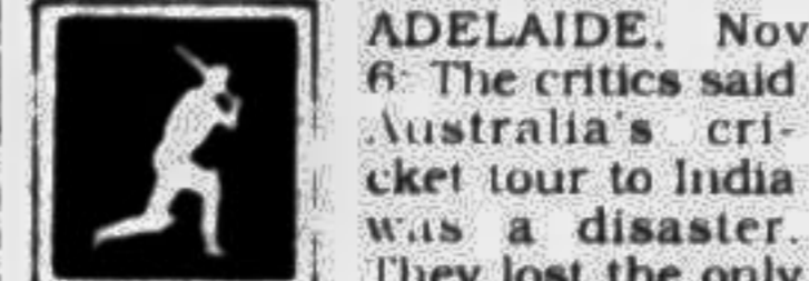
TAYLOR ... 67

ADELAIDE, Nov 6: The critics said Australia's cricket tour to India was a disaster.