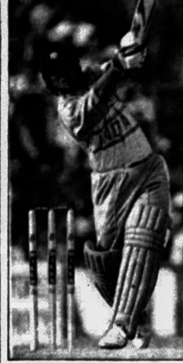
TENDULKAR ... 67