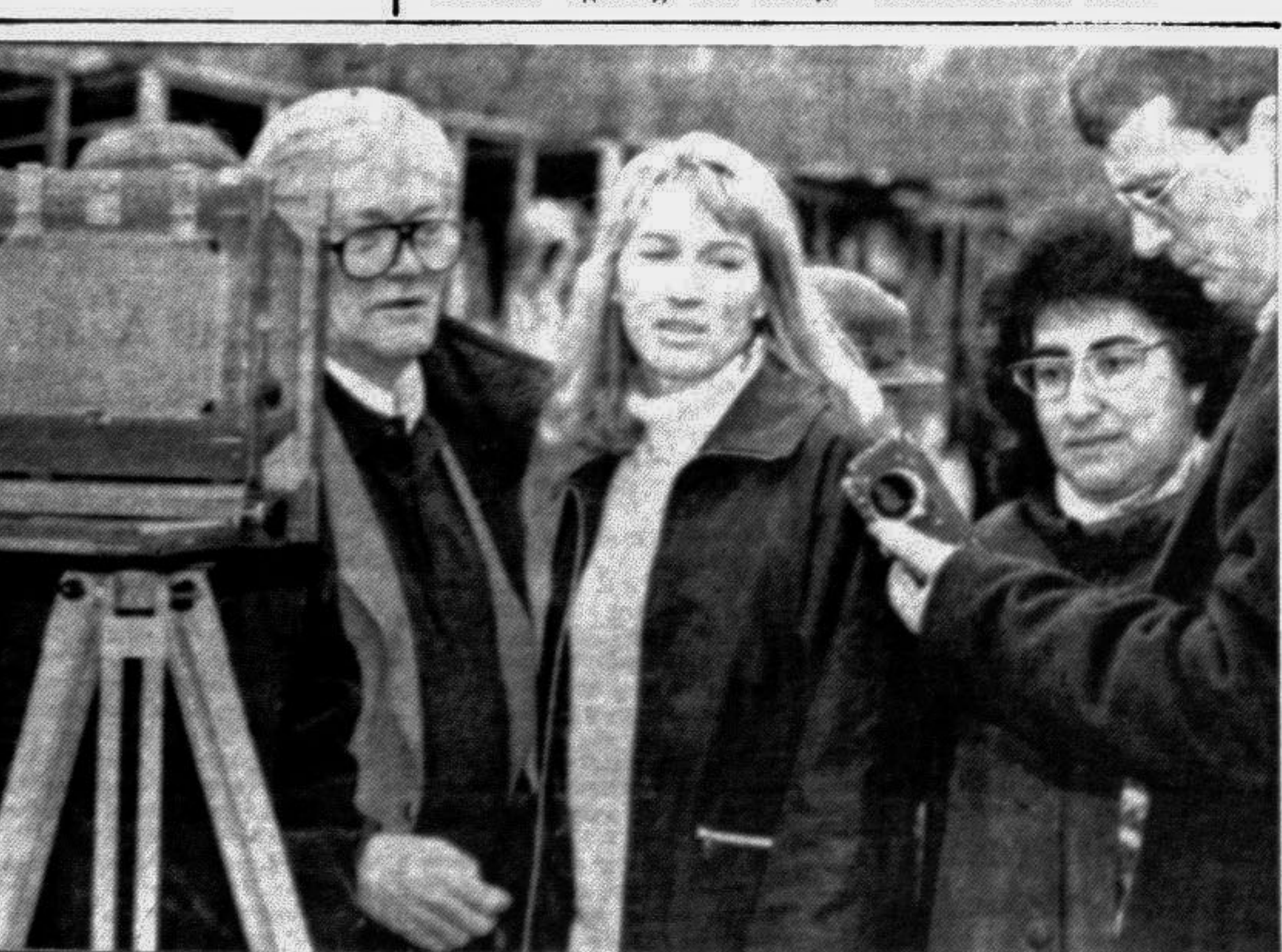
German tennis queen Steffi Graf (C) arrives at a shopping centre to purchase a camera in Moscow on Nov 3. Graf went to Russia to attend the Kremlin Cup final, held on Saturday last.

"I met Harry Hopman and was fortunate enough to have a hit with Australia's Davis Cup team, which included Lew Hoad and Ken Rosewall. It was a significant moment."