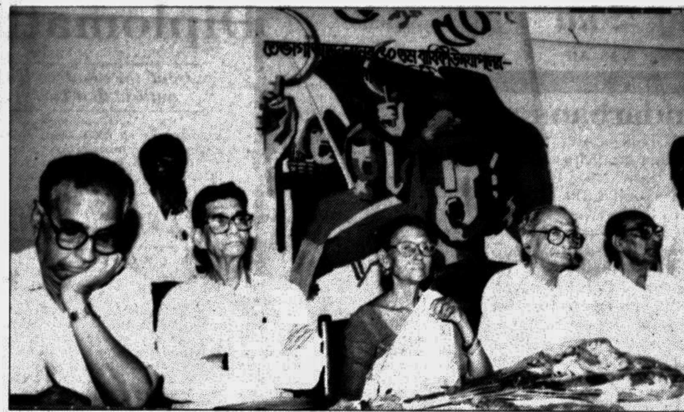
The National Committee on 50th Anniversary of the Tebhaga Movement accorded a reception at the Jatiya Press Club auditorium yesterday to the invited guests from India. Ila Mitra (3rd-R), a central leader of the Communist Party of India (CPI), seen in the picture.

Principal Secretary to the Prime Minister Ataul Haq was also present on the occasion.