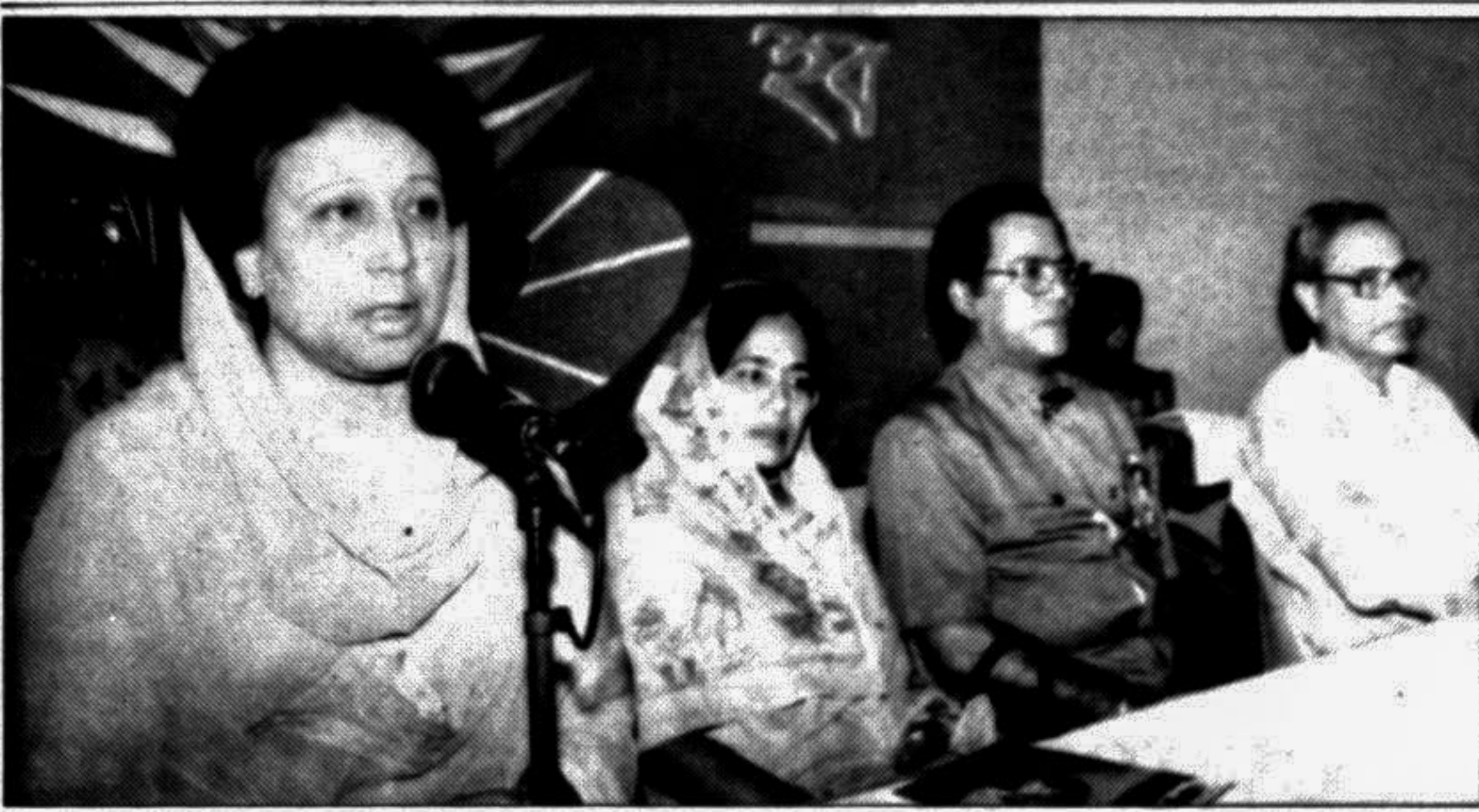
BNP chairperson Begum Khaleda Zia speaking at a prize giving ceremony of 'Amra Zia Habo,' a children's organisation, in the city yesterday.

PLEASE CONTACT: BANGLADESH AIR EXPRESS INT'L LTD. Head Office: 9565114, Fax: 9565112, Gulshan: 887771, Chittagong: (031) 712127, Khulna: (041) 25008