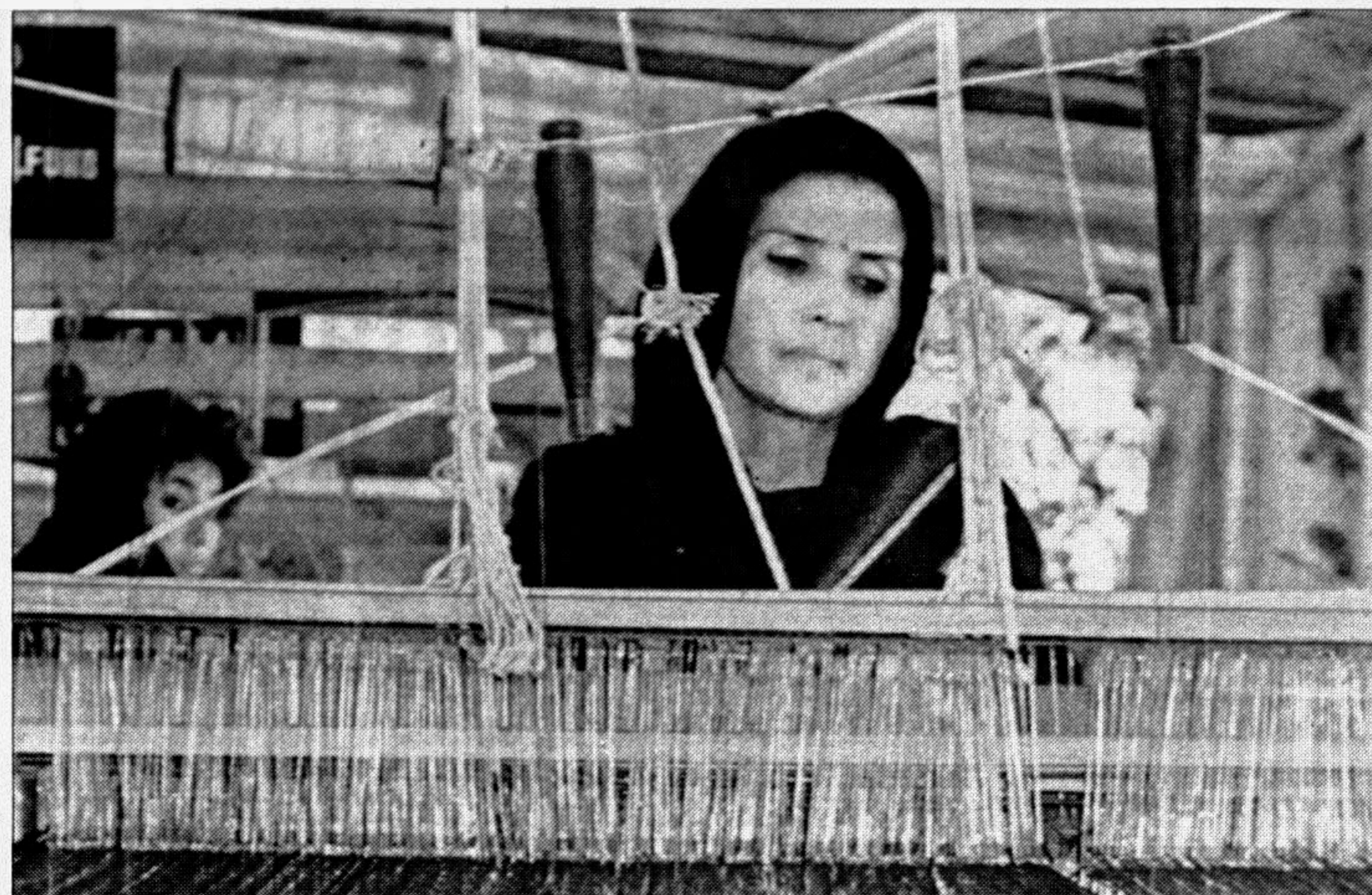
An unidentified Afghan widow weaves a turban for an aid agency project in suburban Kabul aimed at making the capital's poorest widows economically self-sufficient, on Wednesday.

about very limited administrative expertise with many people who have to handle sizable amounts of money.