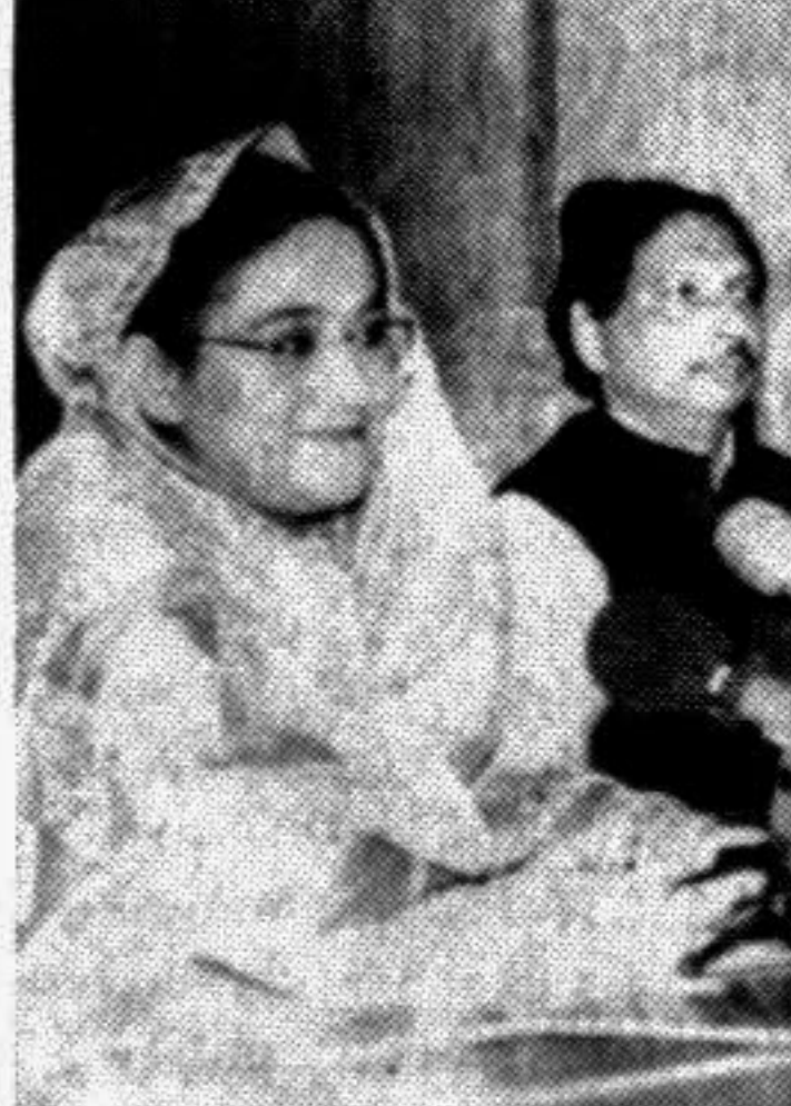
Prime Minister Sheikh Hasina addressing a press conference yesterday.

Prime Minister Sheikh Hasina yesterday turned her visit to the United States successful and said that she received encouraging response from foreign investors for investment in Bangladesh.