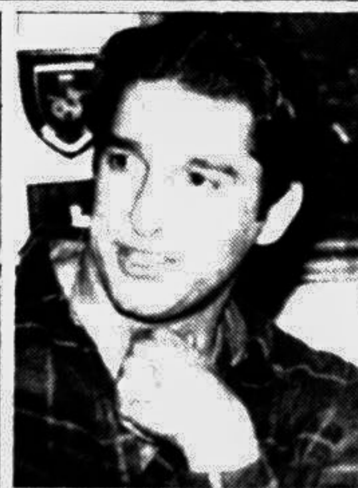
Wasim Akram's magnum opus Sports Reporter

The Asia Infrastructure Development Alliance (AIDA), a tripartite alliance of governments, the private sector and multilateral intergovernmental agencies, was also floated See Page 12 Col 8