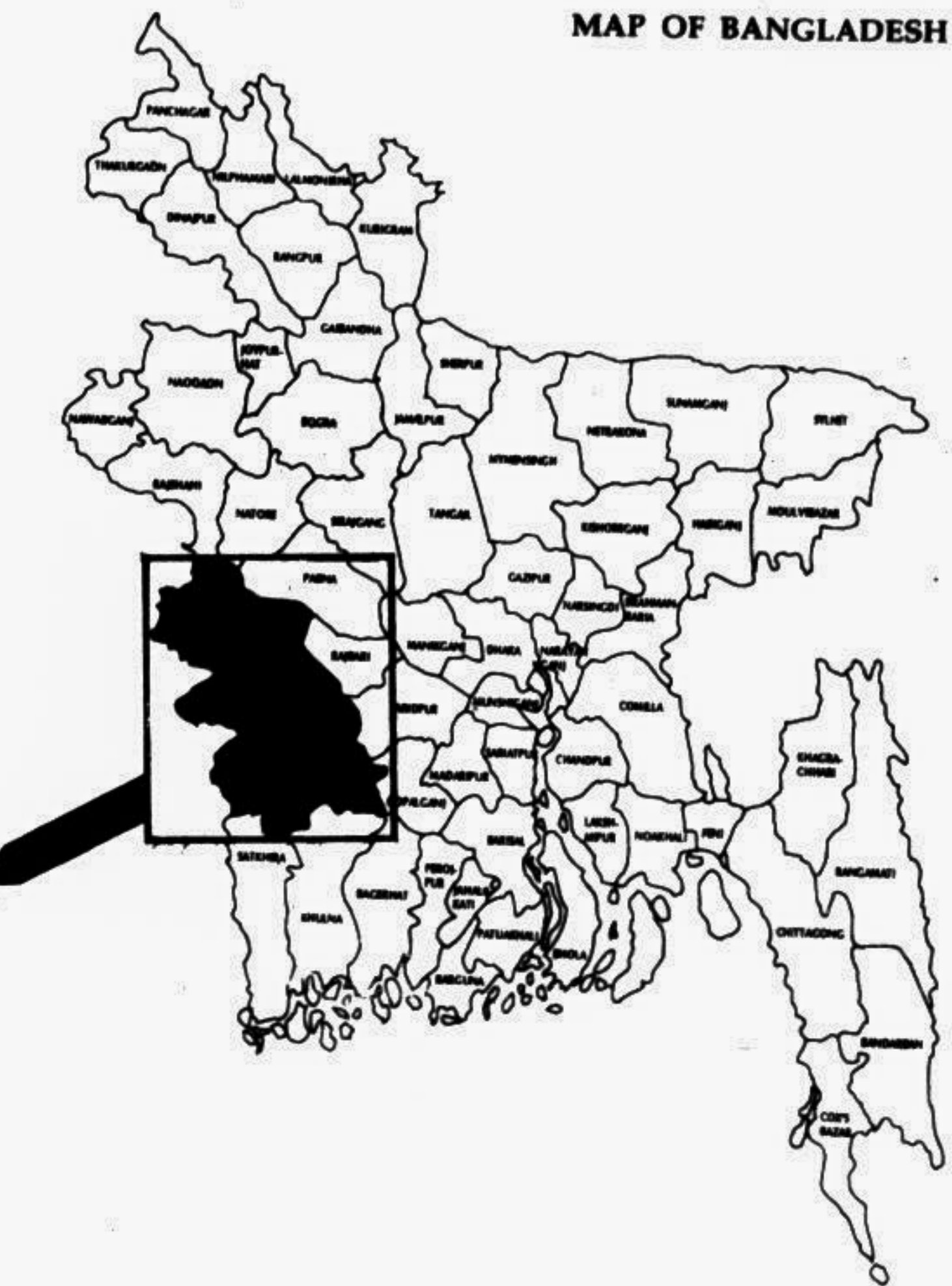
MAP OF BANGLADESH

district following killing of six men belonging to an outlawed party during a gun battle between two rival groups. Three cases have been recorded with local thana and the arrested three have been taken by police on remand for interrogation. Many peace-loving people of the area have left their houses and sought shelter elsewhere after this occurrence. Panic is still prevailing among the villagers. Sources said that vast area of in rural villages in south-western zone of the country are controlled by the outlawed party activists. The outlawed party activists were able to rule the areas due to lack of police vigilance, many villagers allege. According to police, during the last 15 years covering the period from 1980 to 1995, a total of three thousand people were killed by the member of outlawed party, namely, Sarbahara, Biplobi Communist party, Purba Bangla Sarbahara in greater Jessore and Kushtia. From June 1995 till today 60 people were killed by this group, the source informed. Nearly two crore people in 10