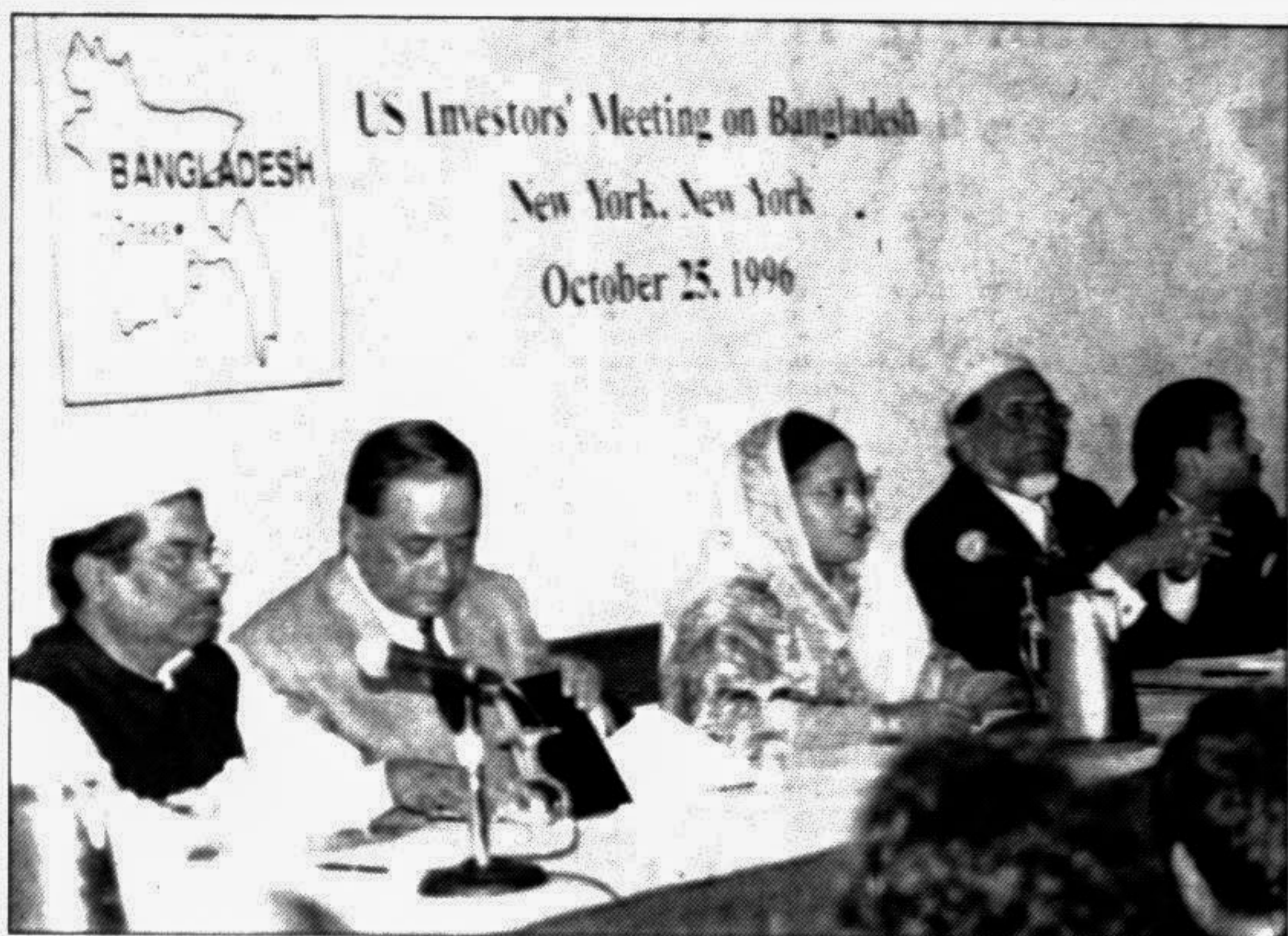
Prime Minister Sheikh Hasina seen addressing a meeting with a group of US investors at the Grand Hyatt Hotel in New York on Friday.