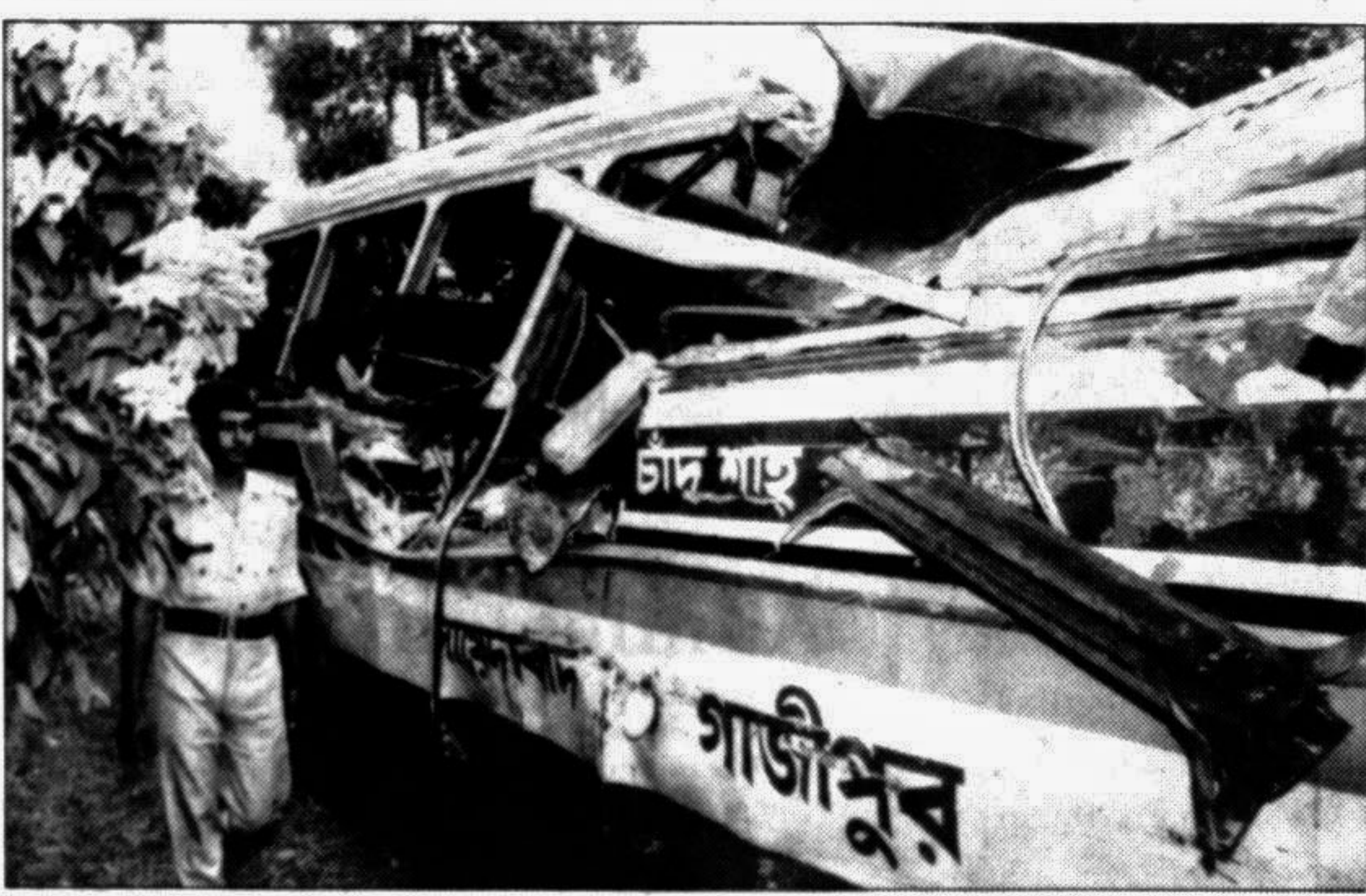
A policeman walks past the wreckage of a bus that met with an accident on the Airport Road in the city yesterday.

The members of the committee discussed various aspects of the system and underscored the need for bringing about some changes in the existing Company Law, meeting sources said.