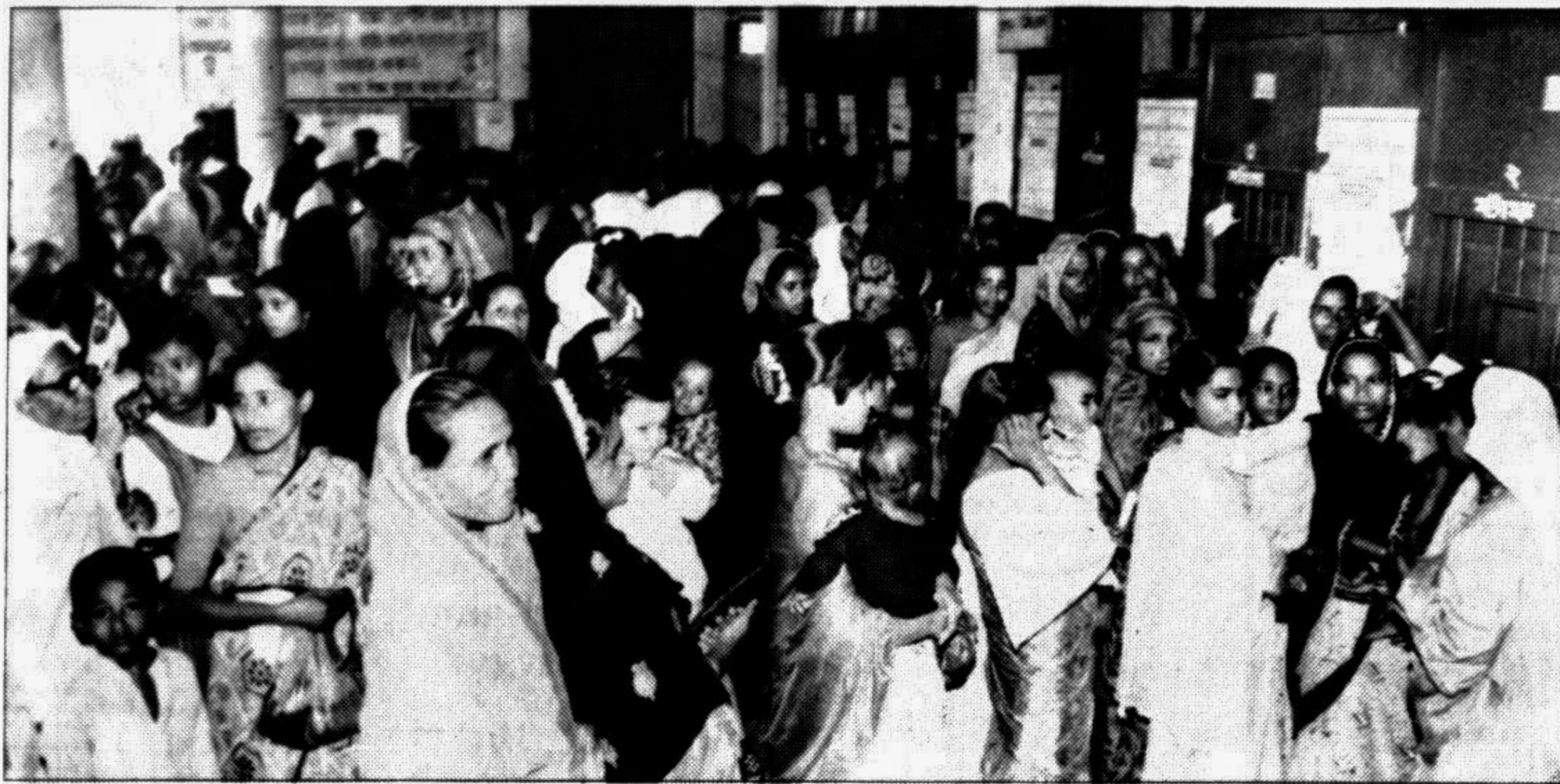
WAIT, HAVE PATIENCE: Hundreds of patients, mostly mothers with babies, are queuing for hours everyday at the outdoor medicine counter of Dhaka Medical College Hospital since October 15. The trouble began when members of Bangladesh Diploma Pharmacists Association went for work-stoppage to press their demands. The strike will continue until November 5 from 9 am to 1 pm.

By Staff Correspondent Two gold rings and about 6,000 were snatched a woman and her daughter from near private clinic at Dhanmondi residential area in the city last night, said police. The snatchers—three youths—came by an autorickshaw and fled away after taking the gold rings and money from the mother and daughter. They were waiting for rickshaw in front of the clinic at Road No 3