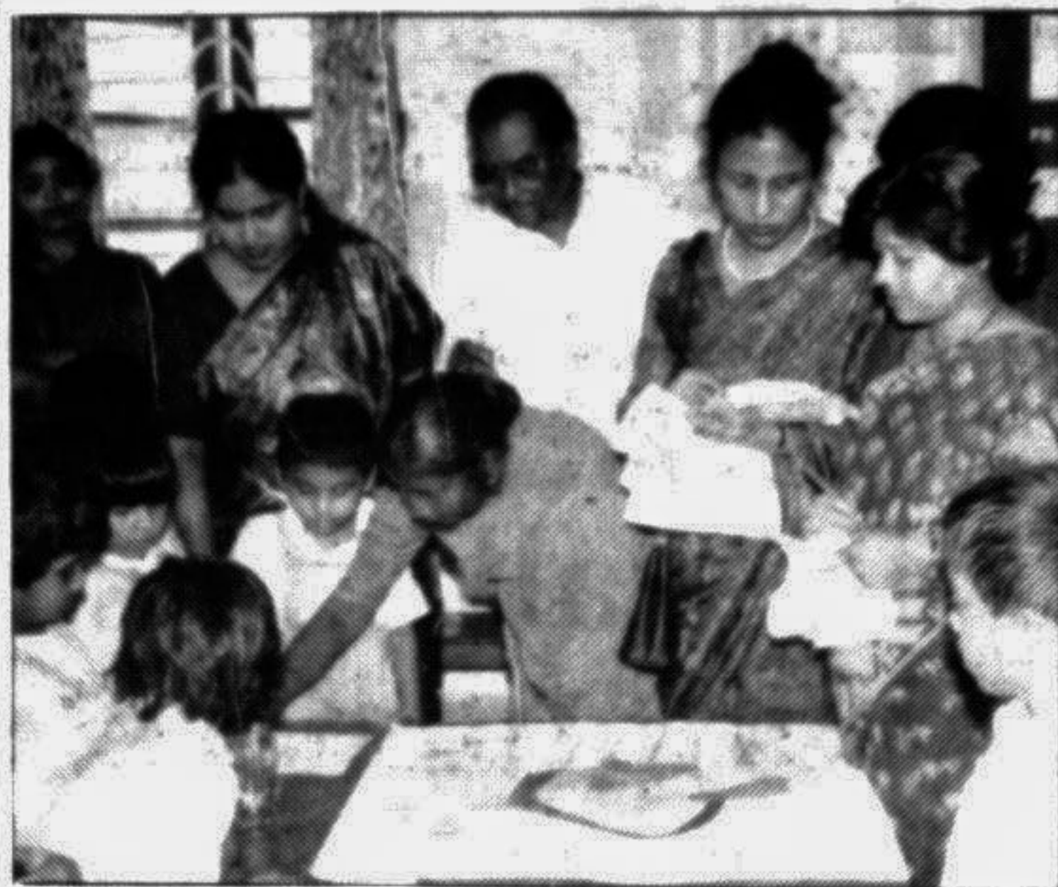
Visitors at a science fair organised by St Jude's Tutorial at its Green Road branch recently.