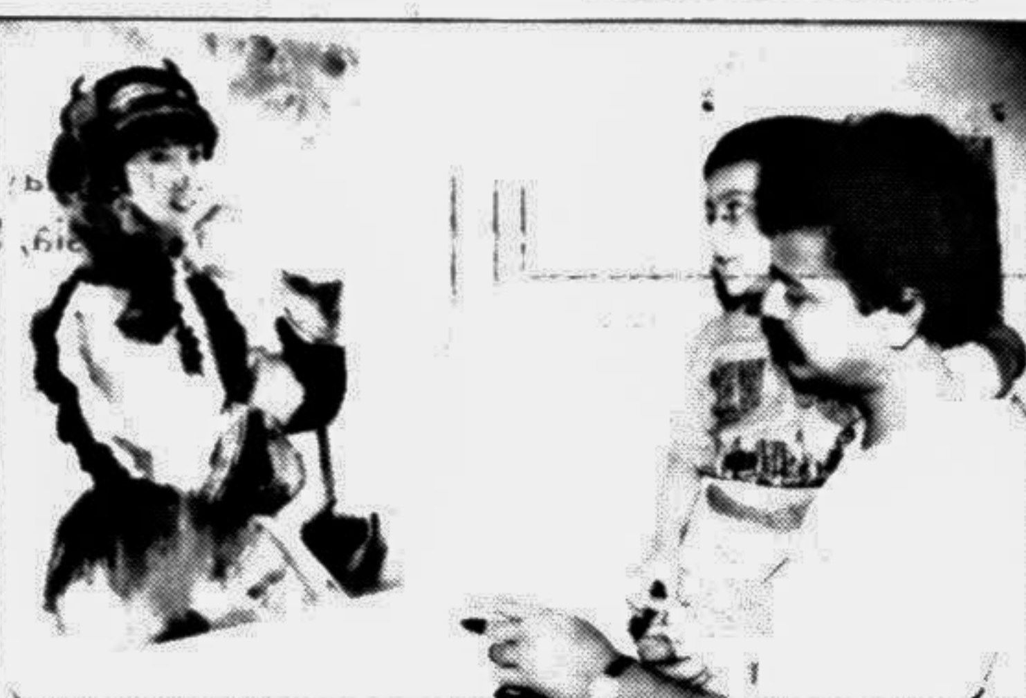
Visitors at the Chinese Water Colour Painting Exhibition that opened at the Shilpakala Academy gallery yesterday.

Our feature item Dhaka Day by Day could not be carried today due to space constraint. The inconvenience to the readers is regretted.