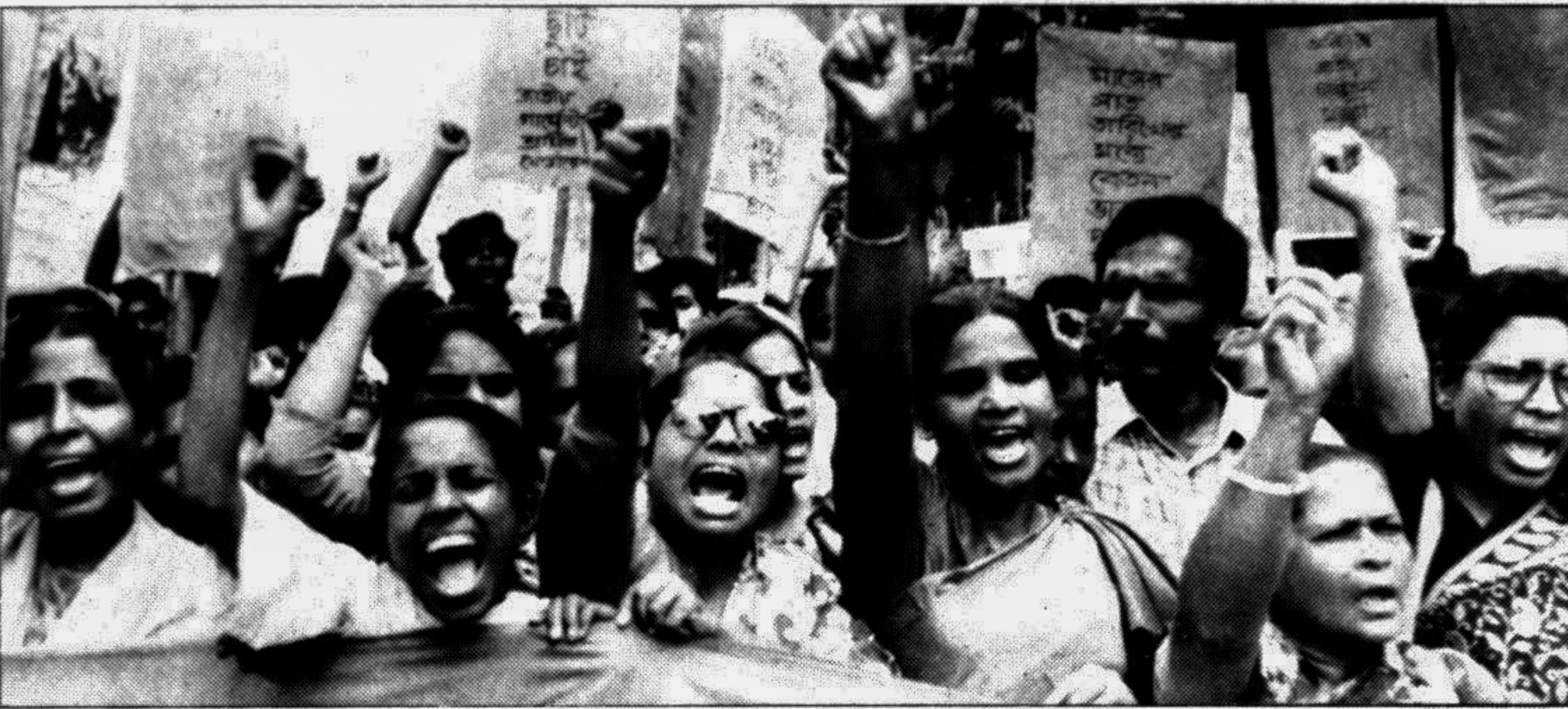
MEMO FOR WEEKLY HOLIDAY: The National Garments Workers Federation (NGWF) yesterday submitted a memorandum to Labour Ministry demanding weekly holiday for the garment workers. Before submitting the memorandum, the garments workers held a rally at Tophkhana road in the city. The NGWF leaders condemned the violation of human rights, ILO conventions and labour laws of the country in the garments sector.

CHITTAGONG, Oct 26: Armed snatchers took away Tk 60,000 from a petrol pump manager while he was carrying the money to a bank at Badur-tola under Panchlaish thana yesterday, police said.