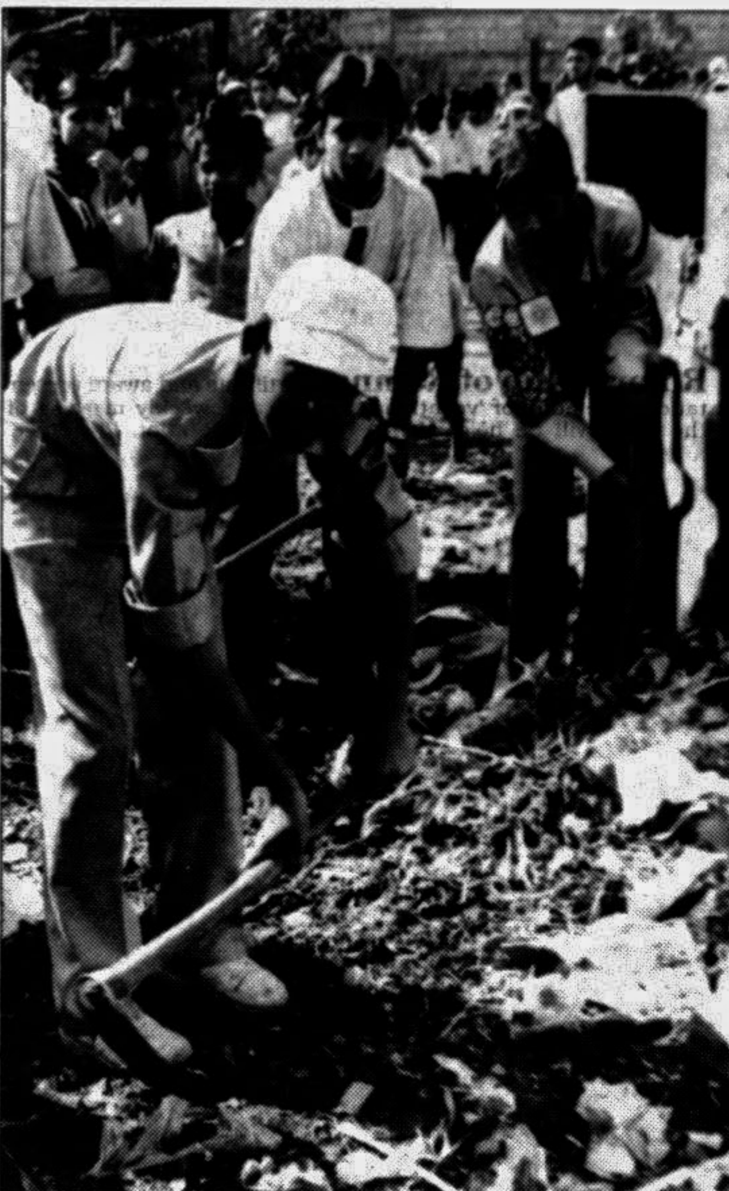
Lending a Hand to Clear the Garbage: Scouts joining the campaign at Shahjahanpur area during the 'Save Dhaka Clean Dhaka' campaign yesterday.

Tender document may also be obtained through the express airmail service on receipt of the price of the tender document plus additional US Dollar 25.00 as mail charge (non-refundable) for each set of the tender document in the following account of BGFL: STD Account No. 22 Sonali Bank Brahmanbaria Branch Brahmanbaria Bangladesh Bids will be received at the Liaison Office of BGFL at 97, Purana Paltan (Bijoy Nagar), Dhaka-1000 up to 1100 hrs BST on 15.12.96 and will be opened on the same day at 1130 hrs BST in presence of the bidders representative(s), if any. Bangladesh Gas Fields Co. Ltd. reserves the right to accept or reject any or all bids at any stage of bidding process without assigning any reason whatsoever. PRS-9/042(TNG)/96 D-1156