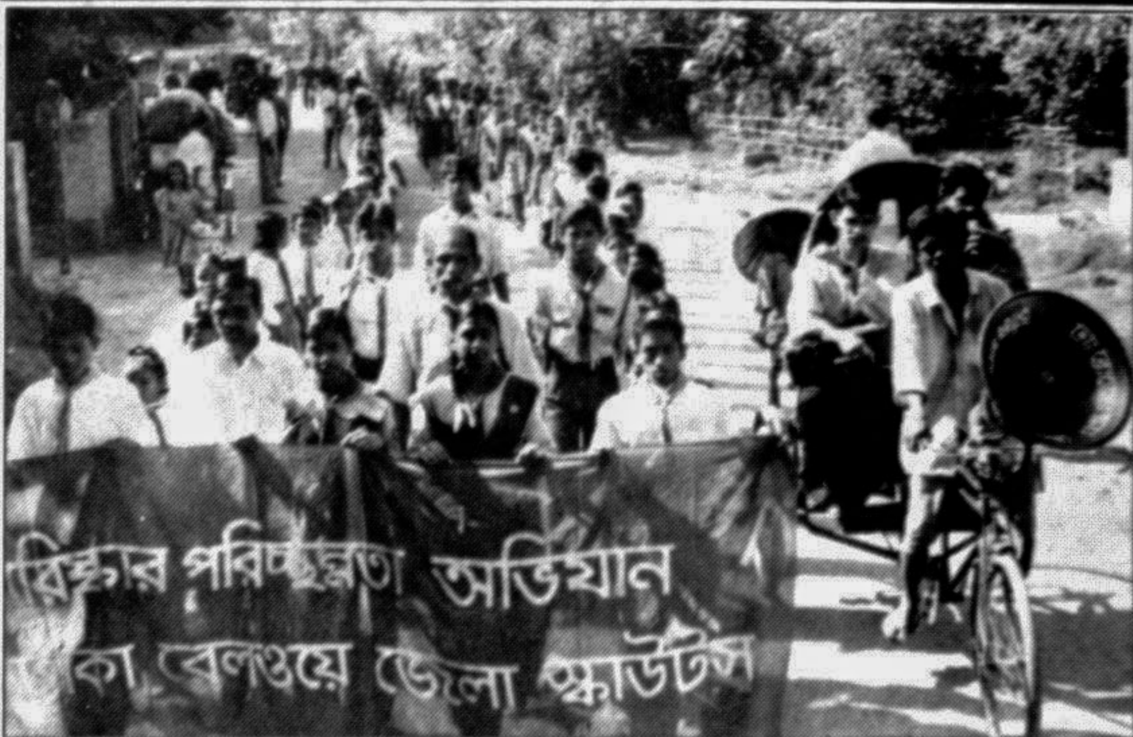
Dhaka District Railway Scouts on their motivation trail yesterday at Shahjahanpur during the Save Dhaka Clean Dhaka campaign urging people to keep their neighbourhood garbage-free.

Government of the People's Republic of Bangladesh Primary & Mass Education Department Food for Education Programme Project Implementation Unit Primary Education Building Mirpur-2, Dhaka-1216 Memo No. FEP/2-5/95 (Part-4) 2305 Dated 15-10-96