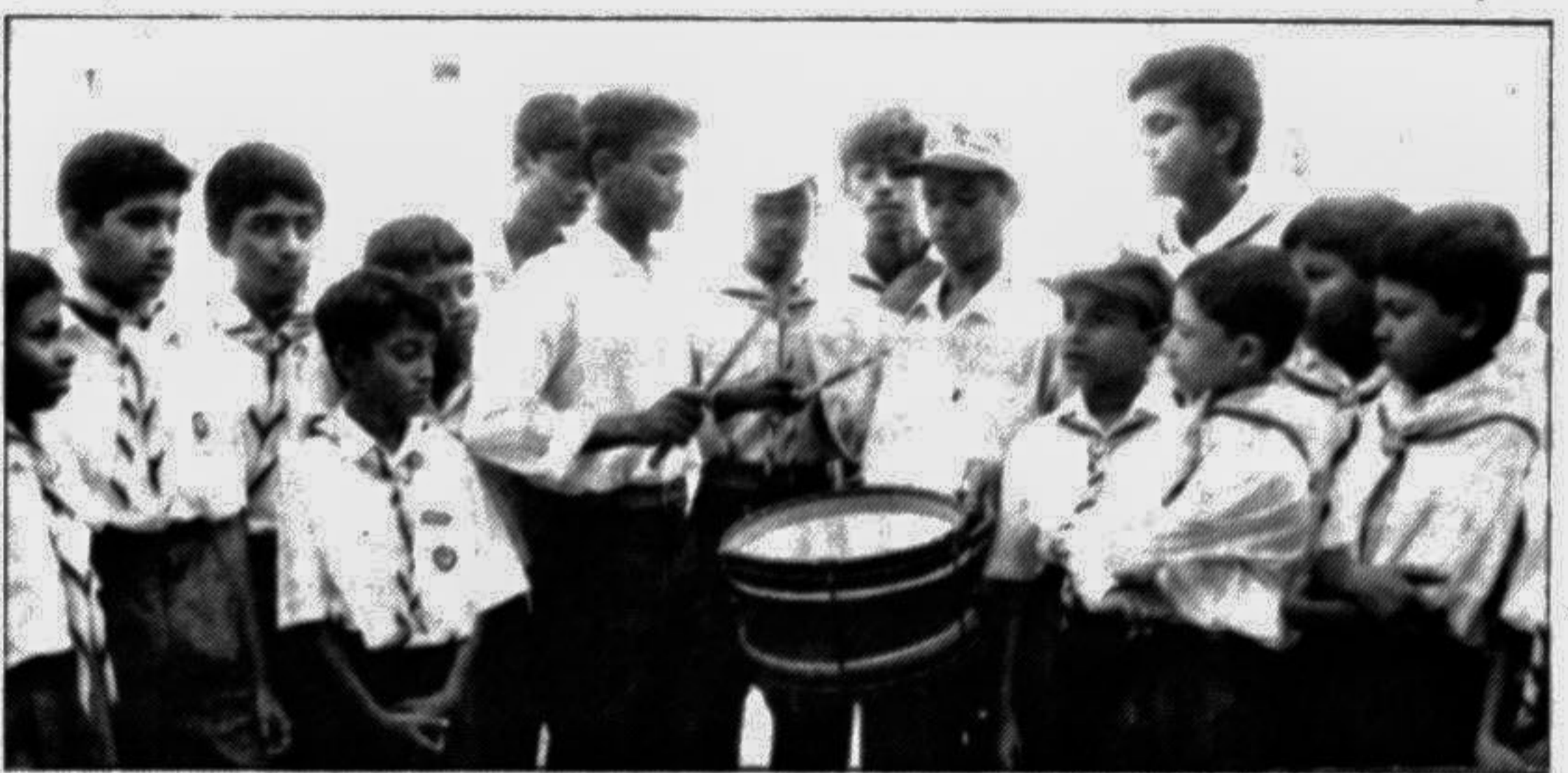
Drums for Save Dhaka Clean Dhaka Campaign: Students of Bangladesh University of Engineering and Technology School attracting attention of the neighbours during their door-to-door campaign to keep the area tidy yesterday.

Bangladesh Gas Fields Company Limited (A Company of Petrobangla) Court Road Brahmanbaria-3400