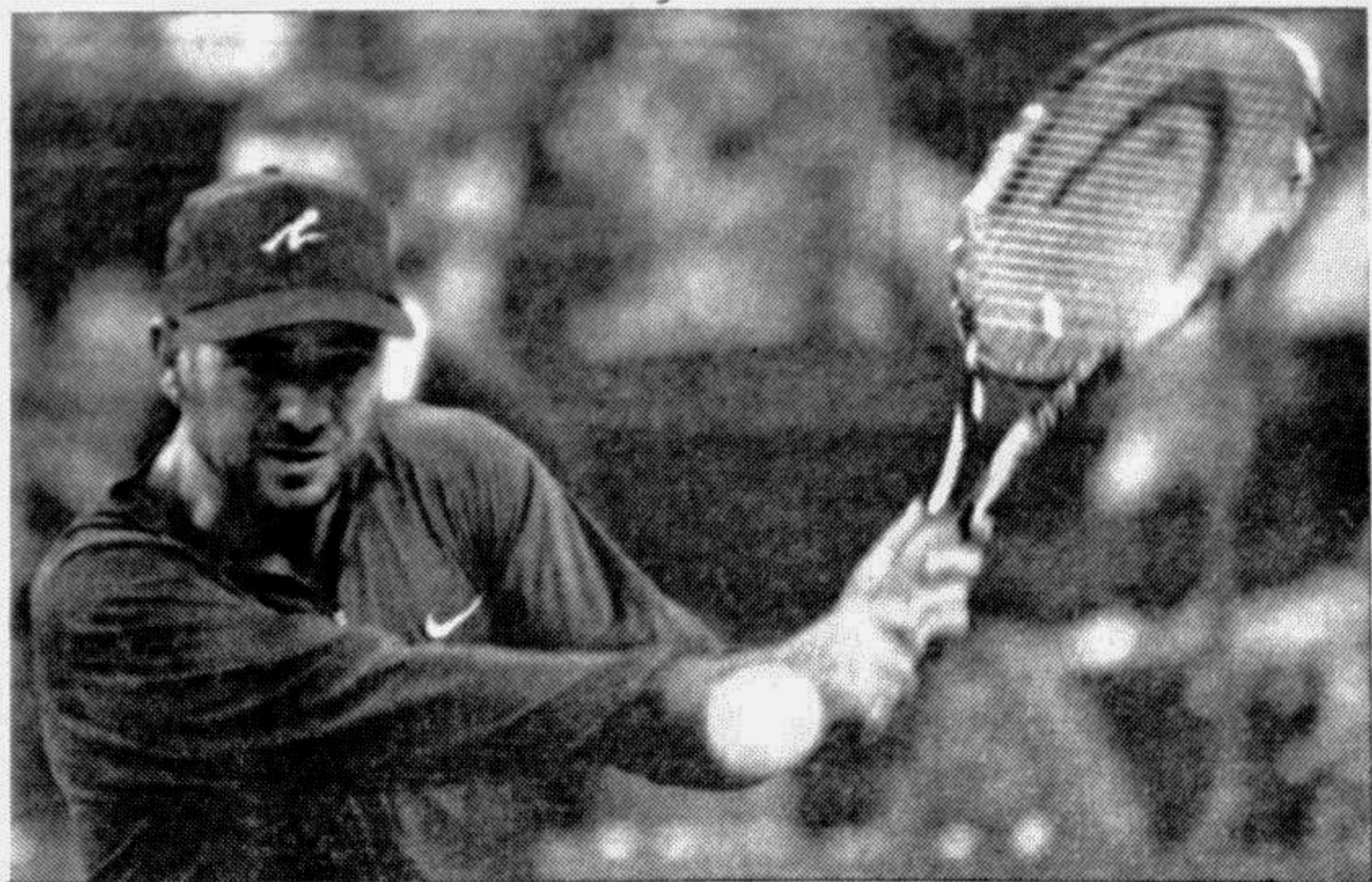
Andre Agassi of the United States plays a backhand return against Spaniard Alberto Berasategui during their Eurocard Open engagement in Stuttgart, Germany Oct 23. Agassi won straight sets.

Roma were not available for comment on the reported move.