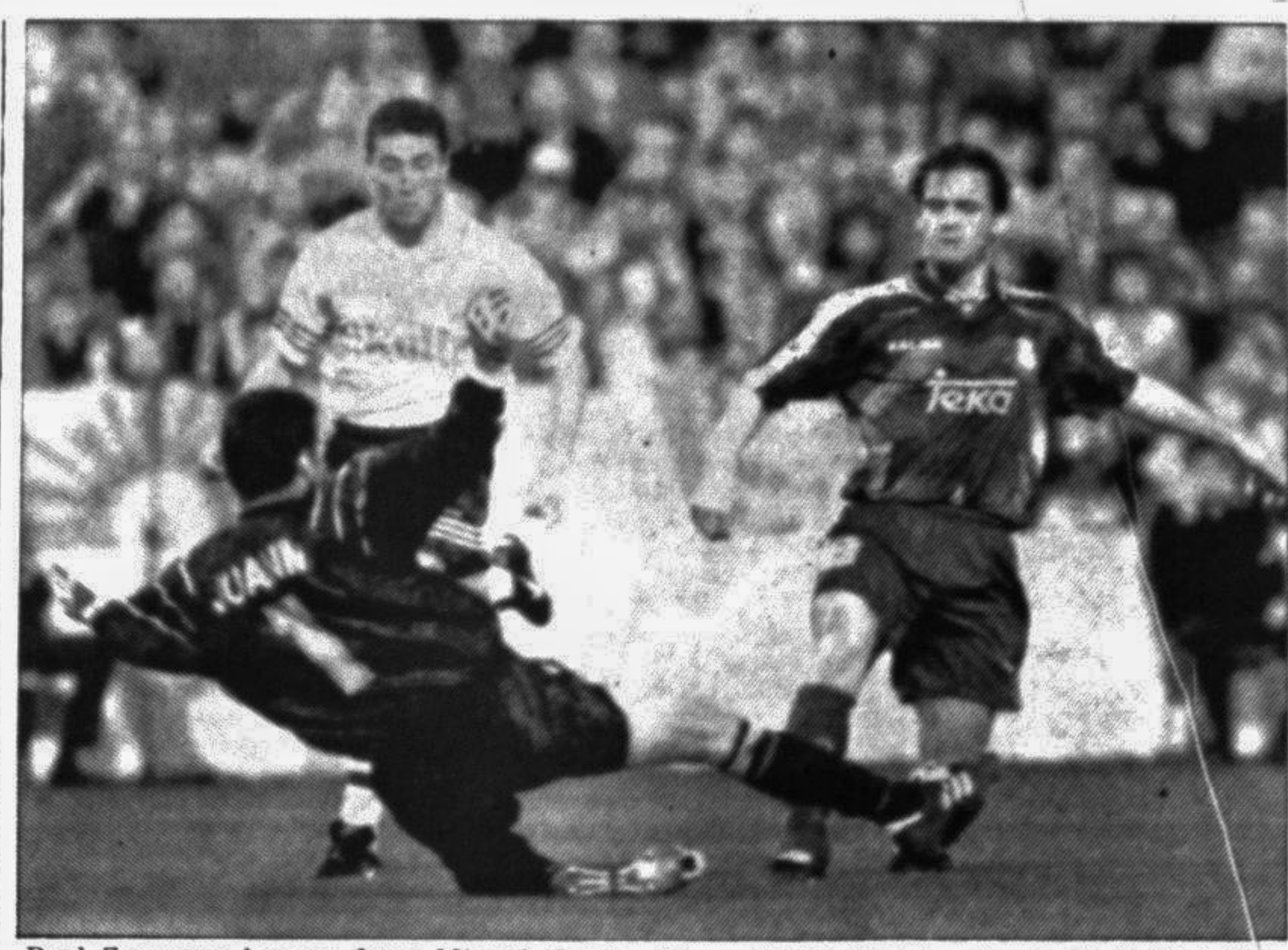
Real Zaragoza keeper Juan Miguel Garcia "Juanmi" (1) tries to stymie Real Madrid's Yugoslav forward Pedrag Mijatovic (R) during their league encounter in Zaragoza on Oct. 22. Madrid won 2-1.

Martina Hingis (Swiss tennis sensation) "My life for me is very normal, because I've already played tournaments since I was six years old. I always knew that I would be a tennis player, but I never worried about how good I could become. I think I'm doing pretty good for my age, but it isn't because I was in a big hurry to go to the top."