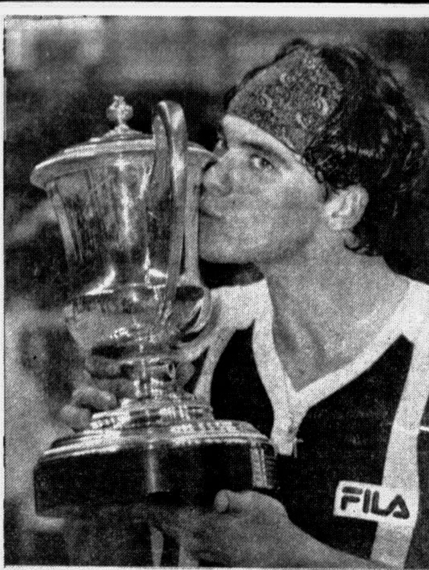
Australia's Mark Philippoussis kisses the trophy after beating Swede Magnus Larsson in the final of the Toulouse Open tournament in France on Oct 20. Philippoussis won 6-1, 5-7, 6-4.