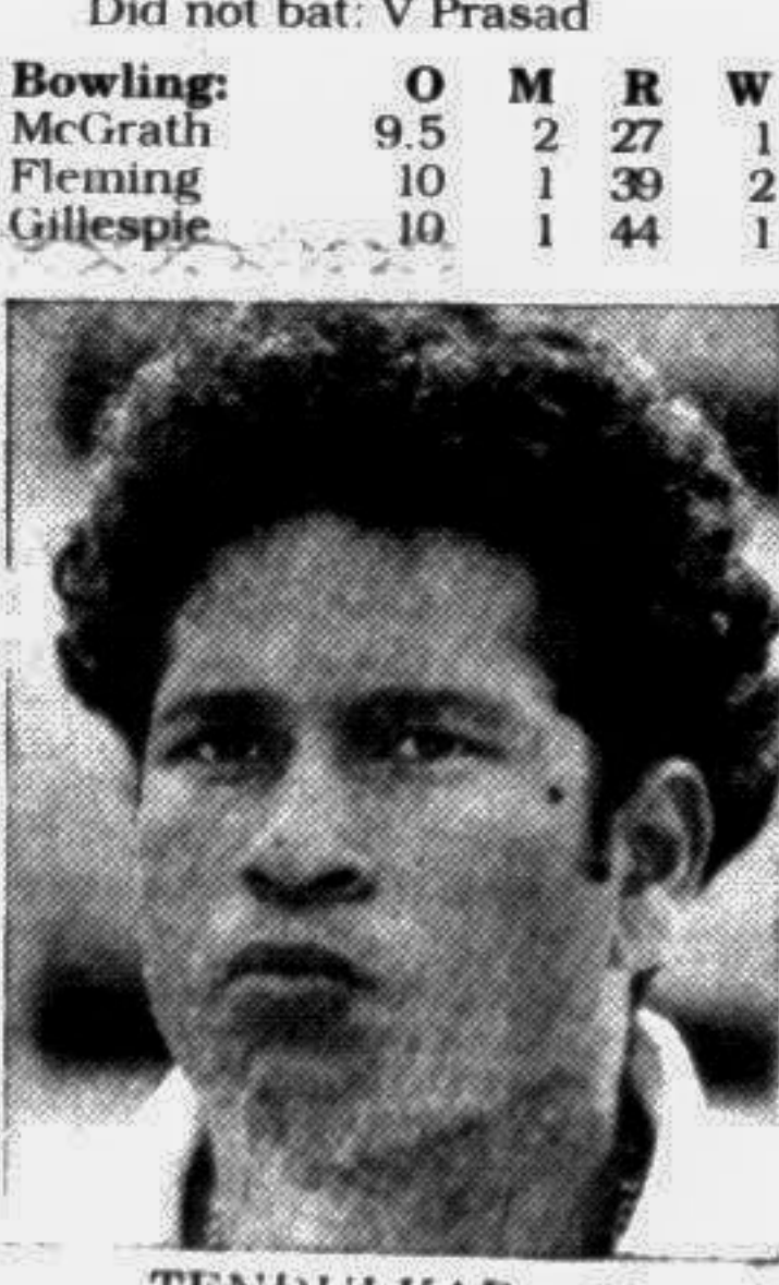
TENDULKAR ... 88

Taylor anchored the side hitting a dashing 105 after quick dismissals of opening partner Mark Waugh for four.