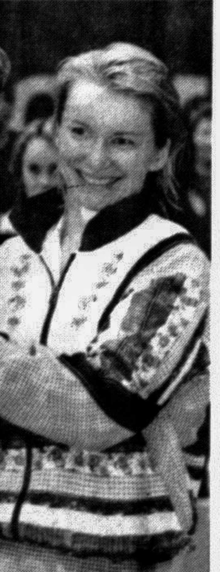
Czech Jana Novotna poses with the trophy after winning the final against Switzerland's Martina Hingis at the European Indoors tournament in Zurich on Oct 20.