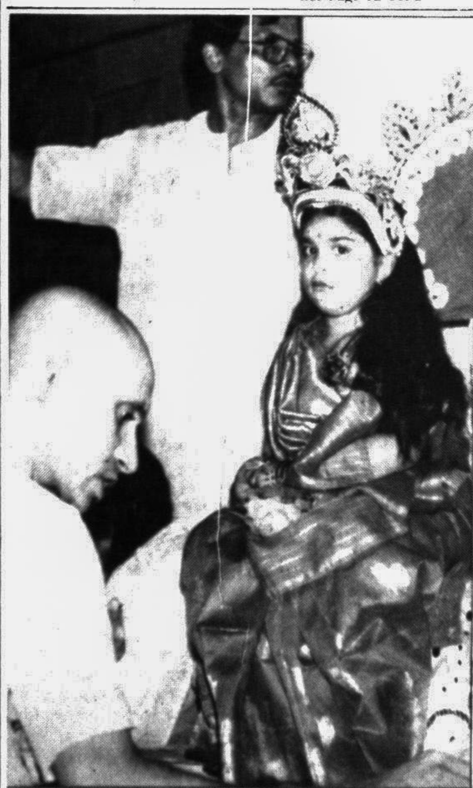
The Hindu community observed Kumari Puja yesterday.

But the hopes fizzled out into an inconclusive result likely to lead to more years of politics as usual and hamper efforts to reform the economy and bureaucracy.