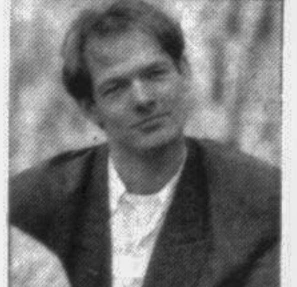
"Madonna Not My Cup of Tea" Page 3