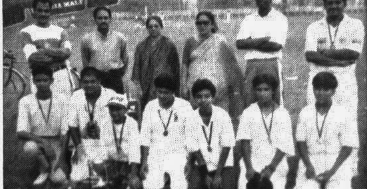
The triumphant Sumarians, who won the inter-house cricket tournament of Loreto School