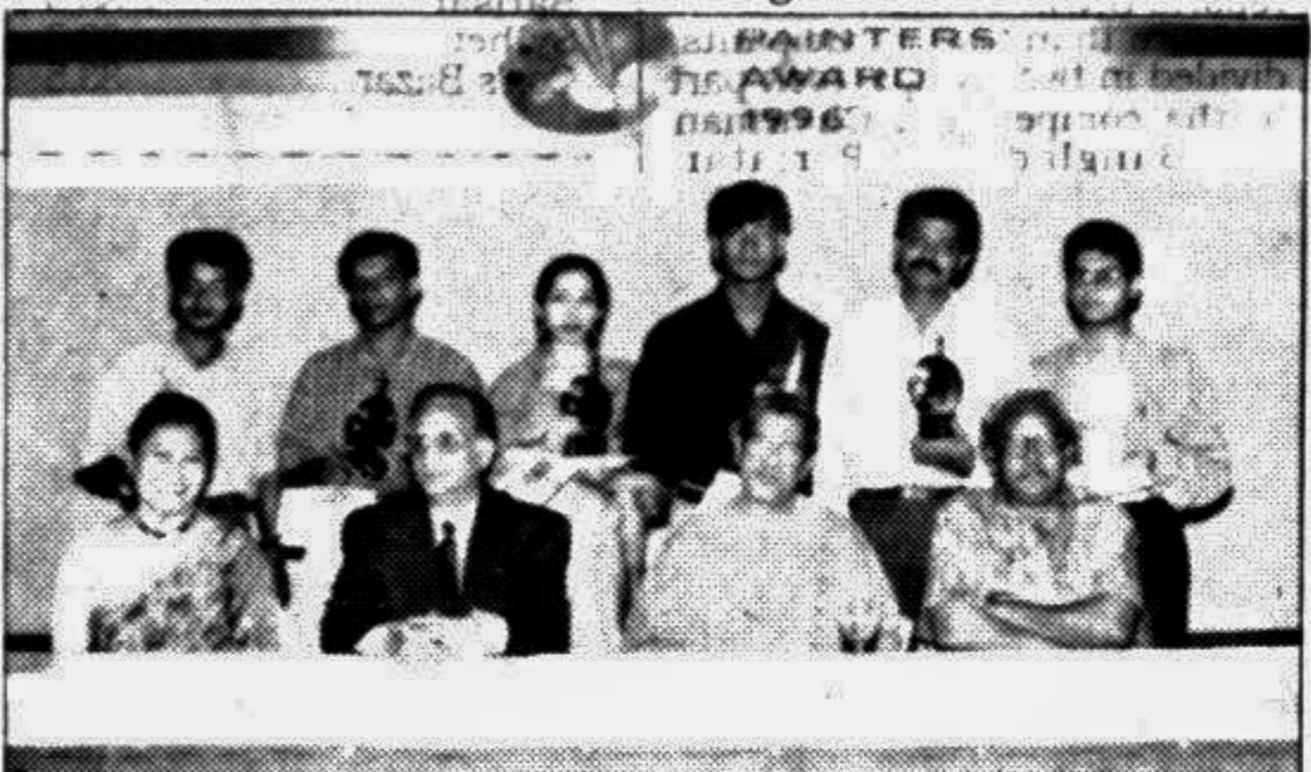
Picture shows winners of Young Painters' Award '96 organised by Berger Paints Bangladesh Ltd at Sonargaon Hotel on Thursday.

Berger Paints Bangladesh Limited recently organized a nation-wide art competition to patronise the new generation in the field of fine arts. The top 6 winners of the "Young Painters Art Competition 1996" were awarded in a colourful ceremony held at Hotel Sonargaon on Thursday. As further recognition of their talents, Berger will publish its 1997 corporate calendar with these six paintings, says a press release. The Guest of Honour of the ceremony was Professor Anisuzzaman, who highly eulogised Berger's role to bring forward untapped talents of the country. He invited other corporate bodies to make such commendable efforts to uplift the heritage of art and culture of Bangladesh.