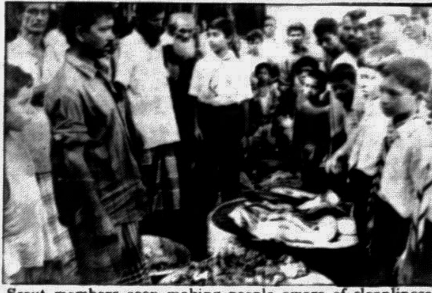
Scout members seen making people aware of cleanliness drive at Palashi Bazar area in the city yesterday.

Corrigendum In the advertisement "Notice/Summon, Sub-judge, Artha Rin Adalat No. 1, Dhaka, Money Suit No. 22/1996, Agrani Bank, B-Wapda Branch, Dhaka..."