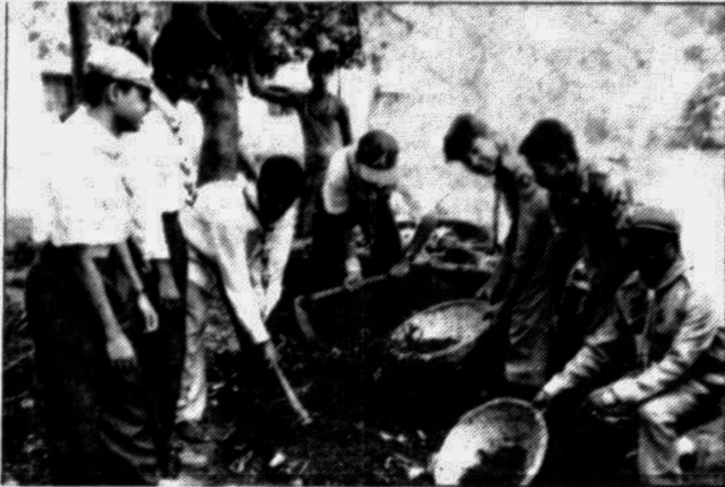
Scouts engaged in removing garbage at Azampur Colony in the city yesterday.