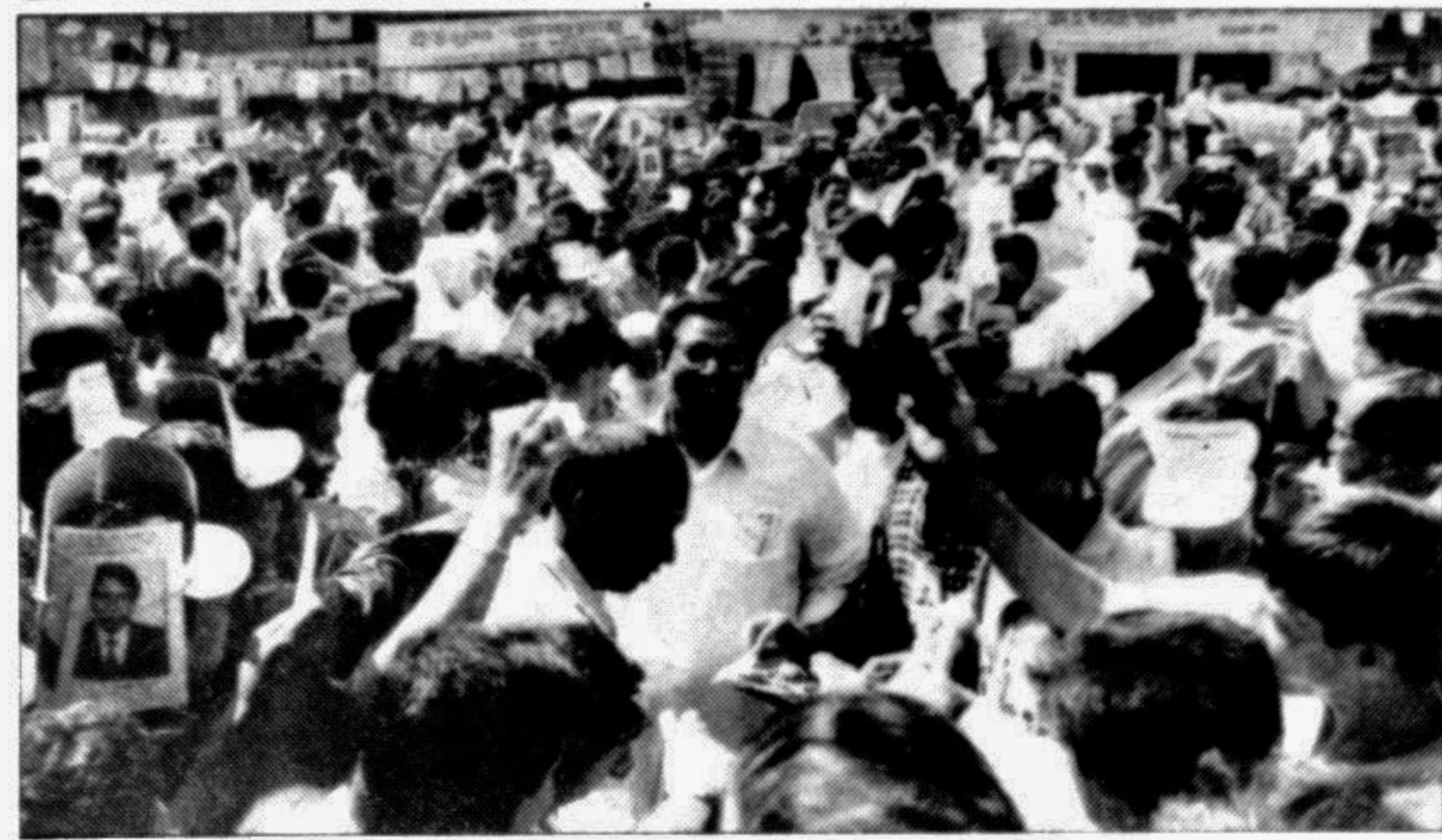
A partial view of campaigners in front of the FBCCI Bhaban during FBCCI election yesterday.

PLEASE CONTACT: BANGLADESH AIR EXPRESS INT'L LTD. Head Office: 9565114, Fax: 9565112, Gulshan: 887771, Chittagong: (031) 712127, Khulna: (041) 25008