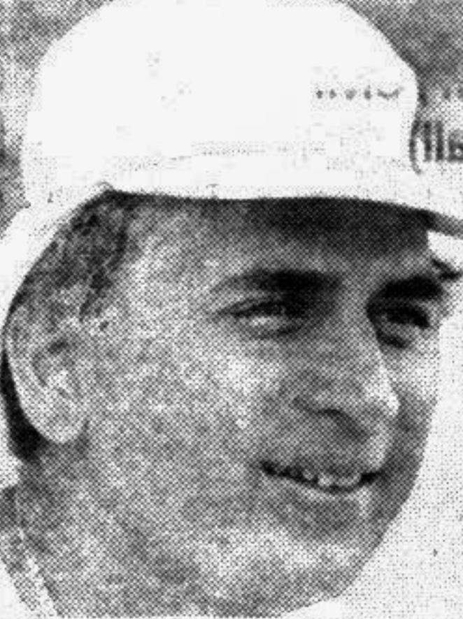
Sunil Gavaskar (Indian batting legend) 'Shane Warne and Mushtaq Ahmed may be in the limelight now, but Anil Kumble is in no way inferior to the two.' Said just before this year's World Cup.