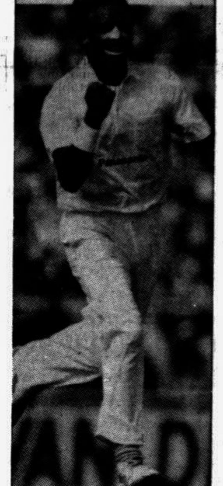
DONALD... 3 for 43

Scoreboard in the one-day international between India and South Africa in Hyderabad on Thursday.