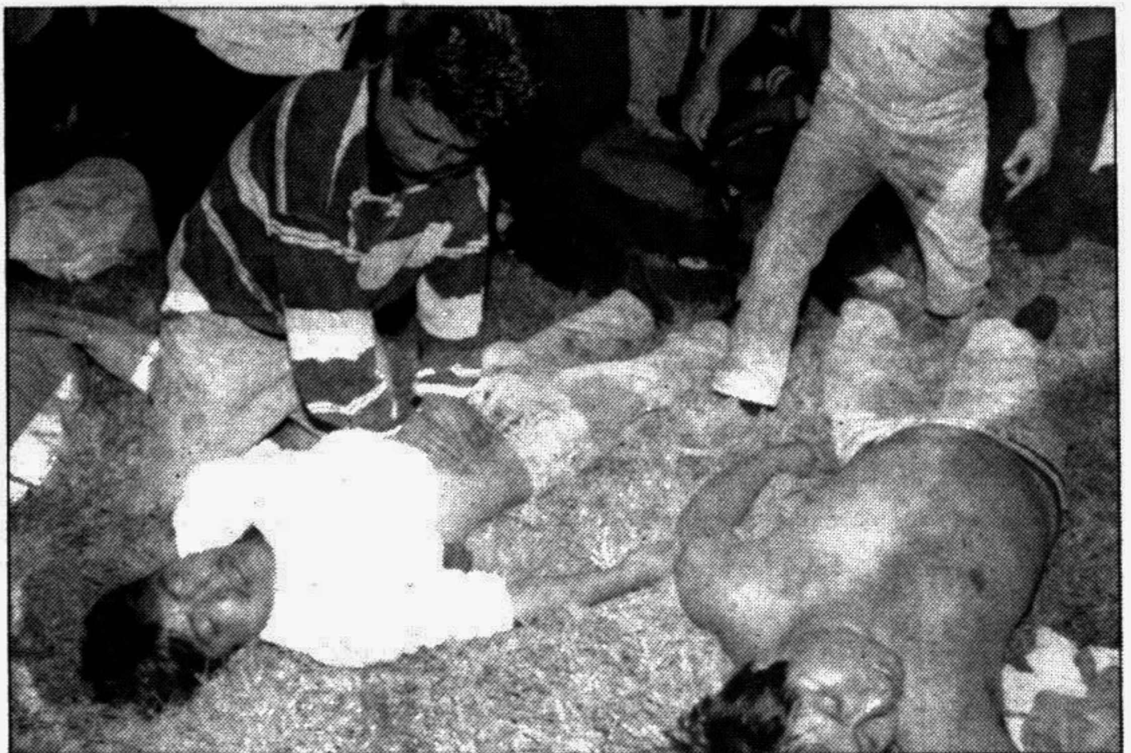
A man trying to give first aid to a victim of a stampede at Mateo Flores Stadium in Guatemala City on Monday.