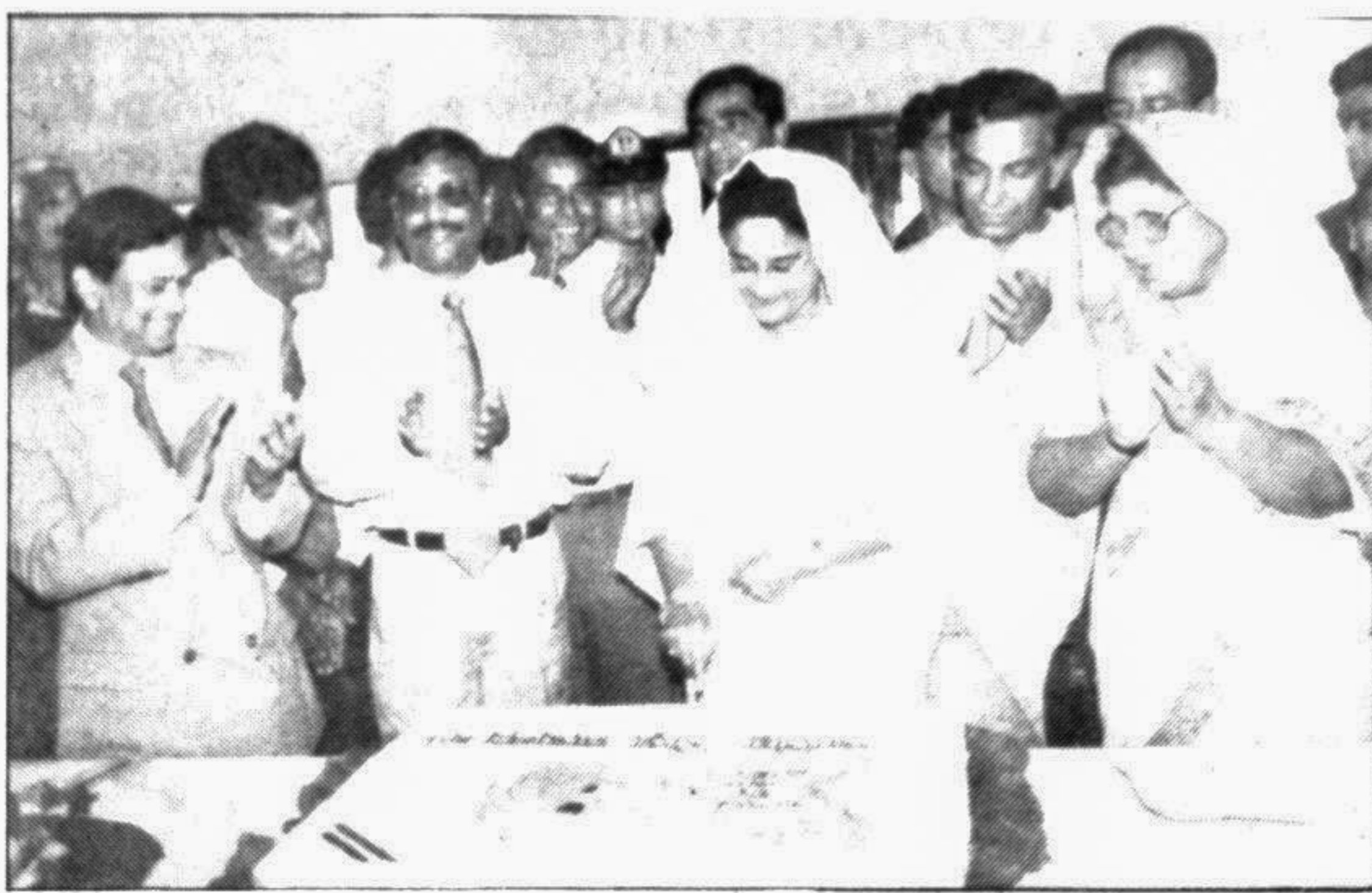
Prime Minister Sheikh Hasina cuts a cake to perform the opening of the national sports conference at the BKSP in Savar yesterday.

After losing to Pete Sampras in the US Open semifinal, First in Brazil RIO DE JANEIRO, Oct 16: More than 400 sports stars from 34 of Brazil's indigenous ethnic groups will meet this week in Goiania in the country's first indigenous peoples' games, reports AFP.