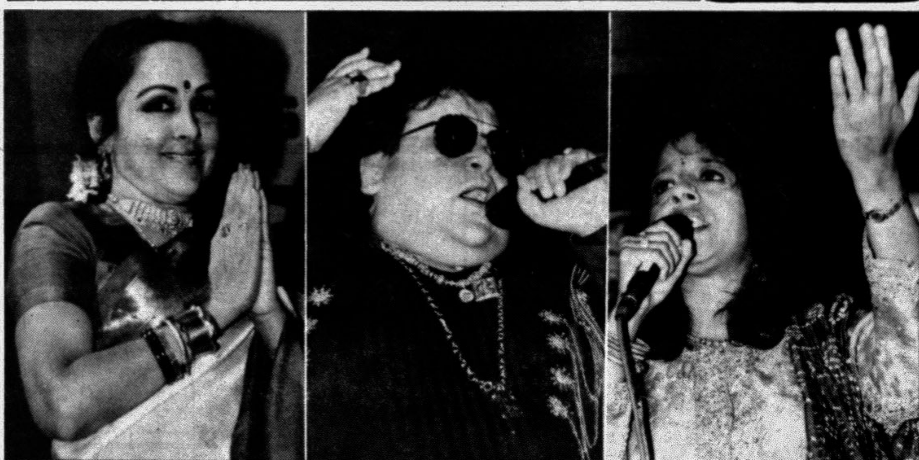
Indian artistes Bappi Lahiri (C) and Kavita Krishnamurti (R) performing at a concert at the Sonargaon Hotel yesterday on the occasion of the Tourism Month. Bombay film star Hema Malini (L) was also present.

However, the CID refused to give the exact number of people so far interrogated in connection with these two cases.