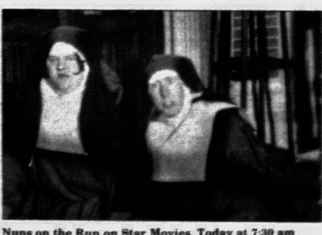
Nuns on the Run on Star Movies, Today at 7:30 am

Start VJ Trey 9:00 Frame by Frame 11:00 The Vibe VJ Luke 12:00 Rewind VJ Sophiya 1:00 By Demand VJ Trey 2:00 Frame by Frame 2:30 First Day First Show 3:00 Palmolive Extra Time Pass 4:00 Planet Ruby 4:30 By Demand VJ Trey 5:30 VJ The Hard Rock Featuring MLTR 7:00 Big Bang VJ Alessandra 8:00 Planet Ruby 9:00 The Vibe 9:30 Mangta Ha 10:00 First Day First Show 10:30 Soul Curry 11:00 House Of Noise VJ Luke 12:00pm Big Bang VJ Alessandra 1:00 Haysah 2:00 By Demand VJ Trey 3:00 Big Bang VJ Alessandra 4:30 V