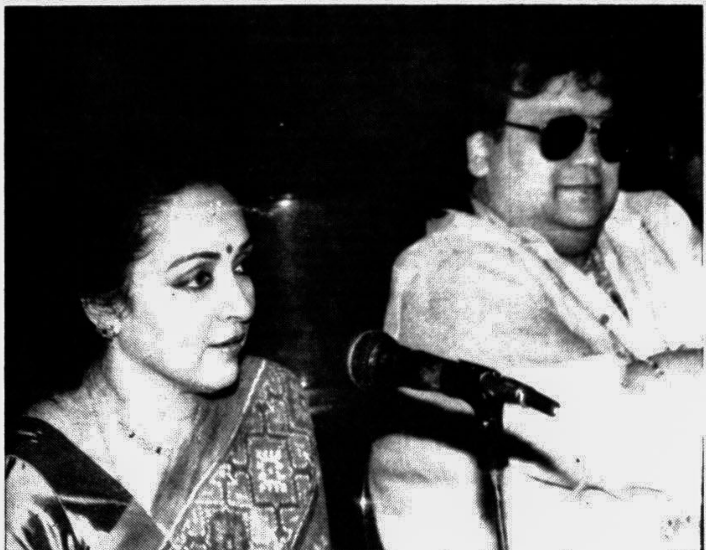
Indian actresses Bappi Lahiri and Hema Malini addressing a press conference at a city hotel yesterday.

For more information call: Head Office: 9561114-7 Fax: 9561112 Dhaka: 887771, Chittagong: (031) 71217, Khulna: (041) 25008