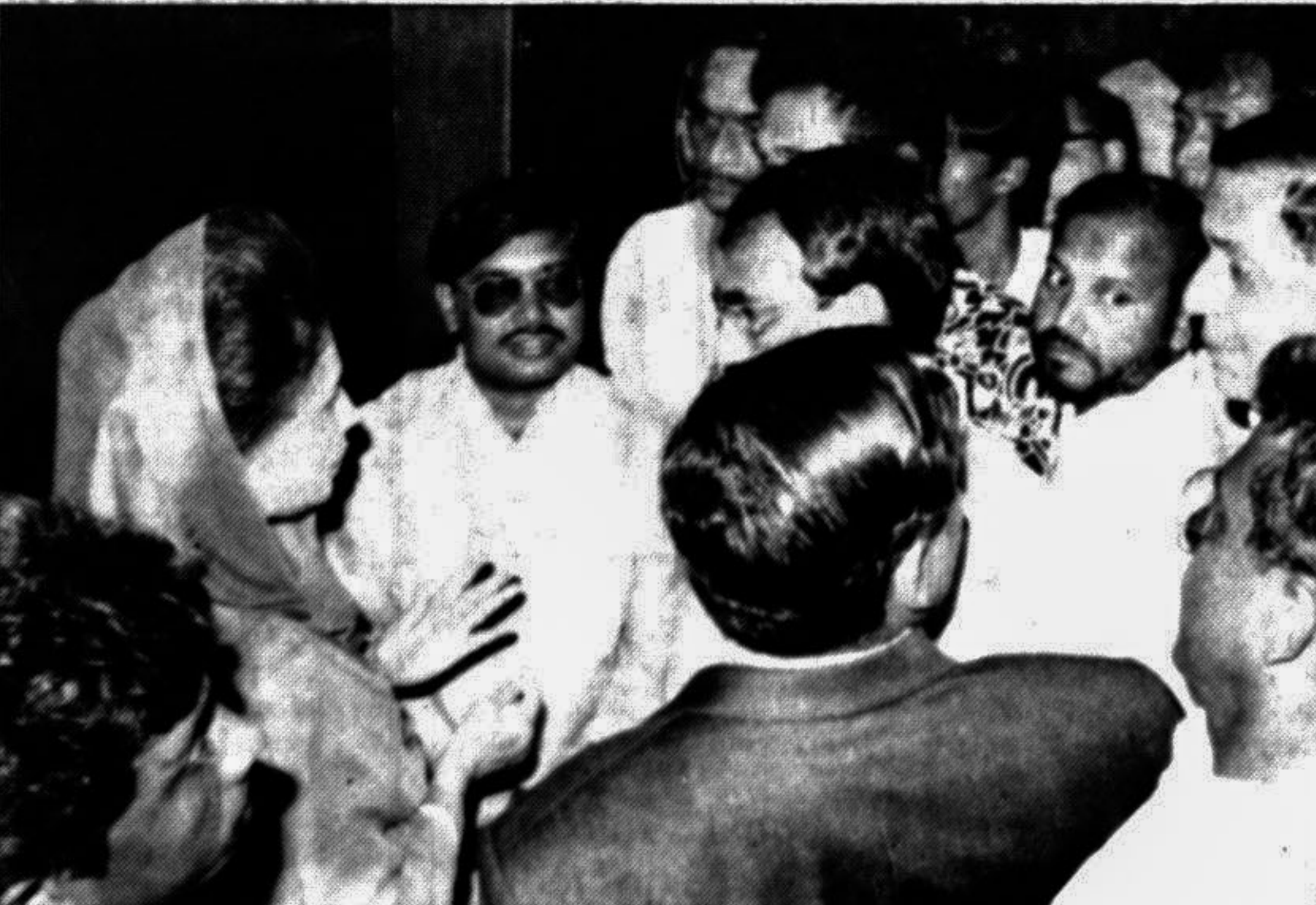
BNP chief and Leader of the Opposition in Parliament Begum Khaleda Zia talking to party leaders at Zia International Airport yesterday prior to her departure for Saudi Arabia.

record fall in share trading at CSE. From Staff Correspondent CHITTAGONG, Oct 13: Chittagong Stock Exchange today witnessed a record fall in share trading following imposition of 'circuit breaker' system. A total of 50 issues were traded on the day, of which, 49 incurred losses while one remained unchanged. Market capitalisation de-