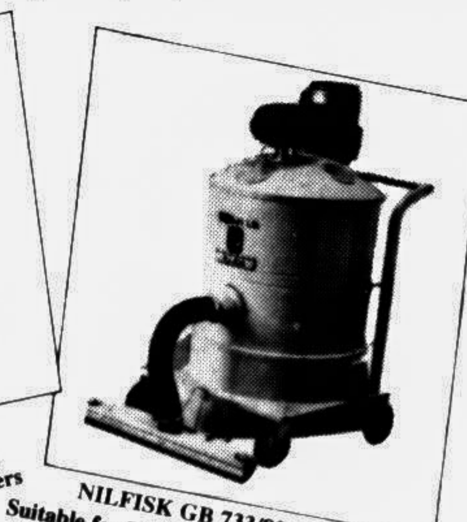
NILFISK GB 733/833, GS 83/82 Suitable for Textile & Jute Mill, Spinning Mill, Knitting Factories and all others Industries