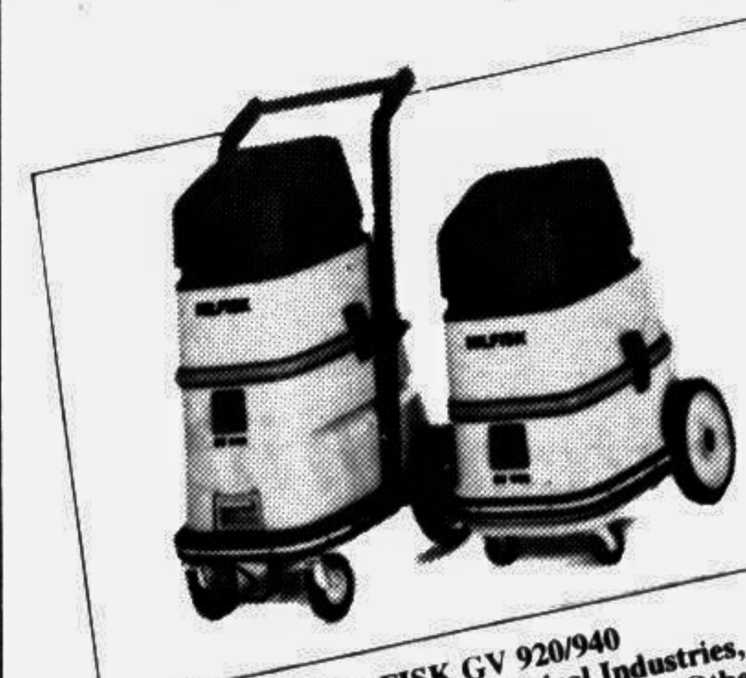
NILFISK GV 920/940 Suitable for Pharmaceutical Industries, Tea Industries, Hospitals, Hotel and Others

Suitable for Textile &amp; Spinning Mills, Knitting Factories, Jute Mills, Pharmaceuticals Industries, Tea Industries, Hotel, Airport and Other Industries