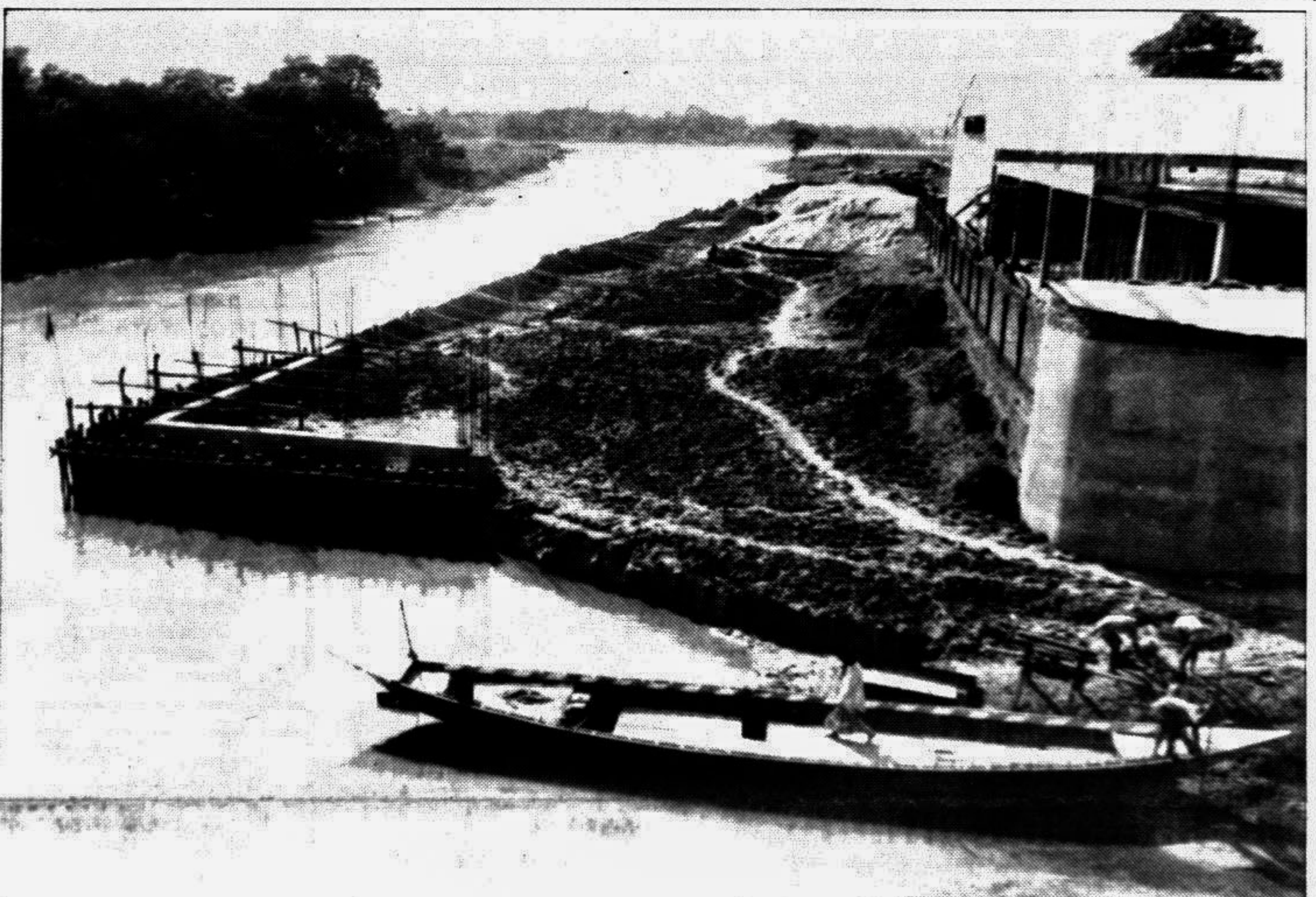
Major portion of the river Dhaleswari at a point near the Bank Colony in Savar thana is being illegally earth-filled for the protection of an under-construction textile mills, obstructing normal flow of the river.

The attackers, said to be members of the daring Joseph group of Mohammadpur area, See Page 12 Col 8