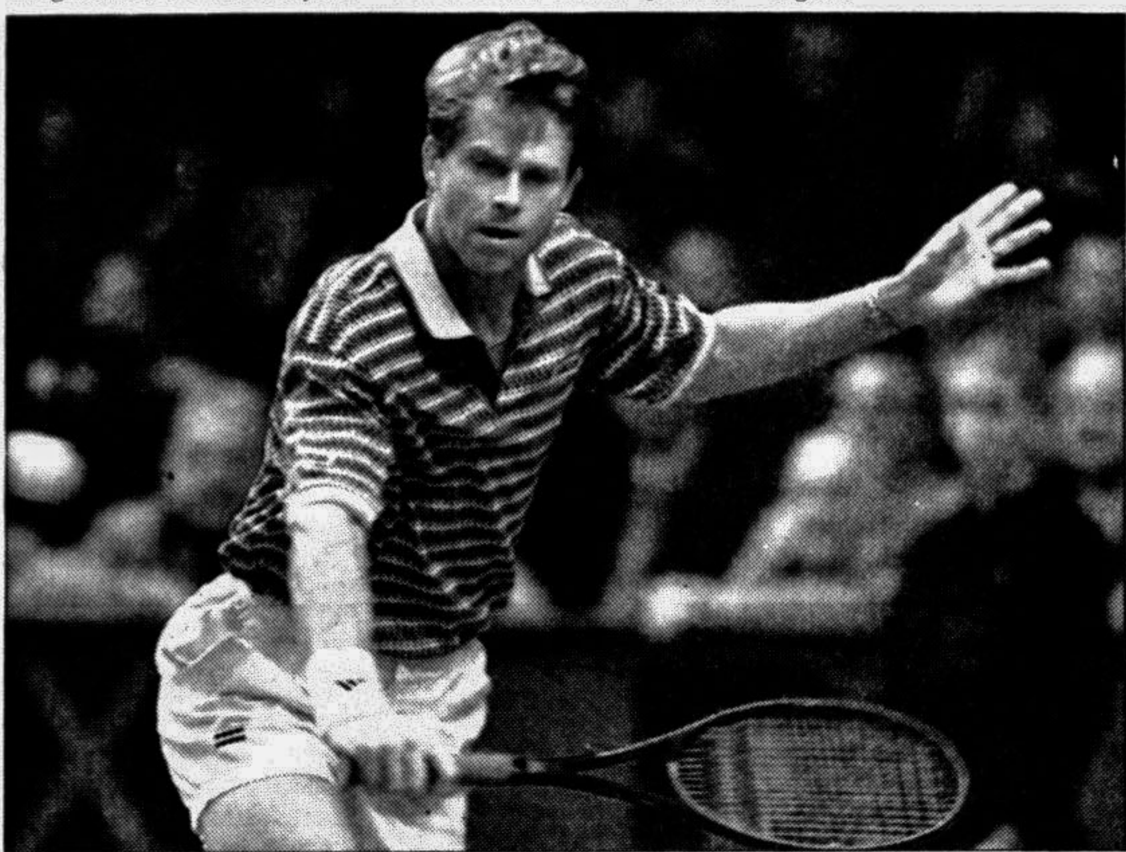
Tennis world's true gentleman-player Stefan Edberg makes backhand slice against Australian clay-court specialist Thomas Muster (not in the picture) during his Vienna ATP tennis tournament on October 10. The illustrious Swede defeated the world number three Austrian.

Becker had also a slow start, dropping serve in the sixth game to lose the first set, before regaining his form and taking the second set with a thundering ace.