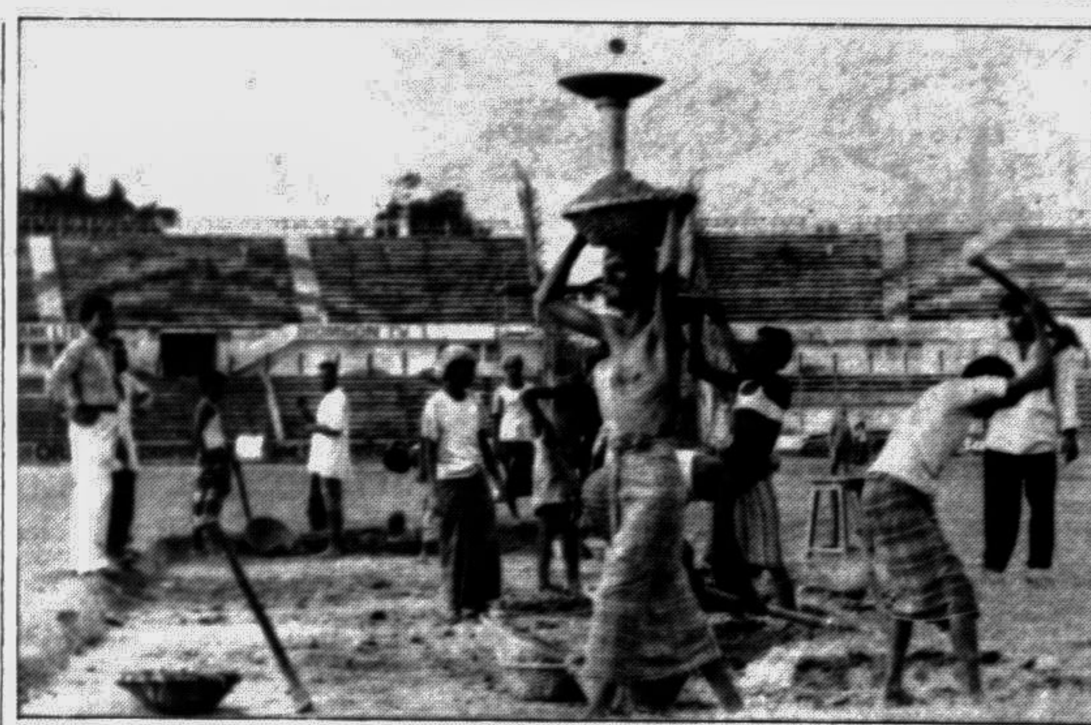
Work on laying a pitch going on in full swing at the Dhaka Stadium yesterday.

Turner has continued to back the event, however, after the political changes in the last decade.