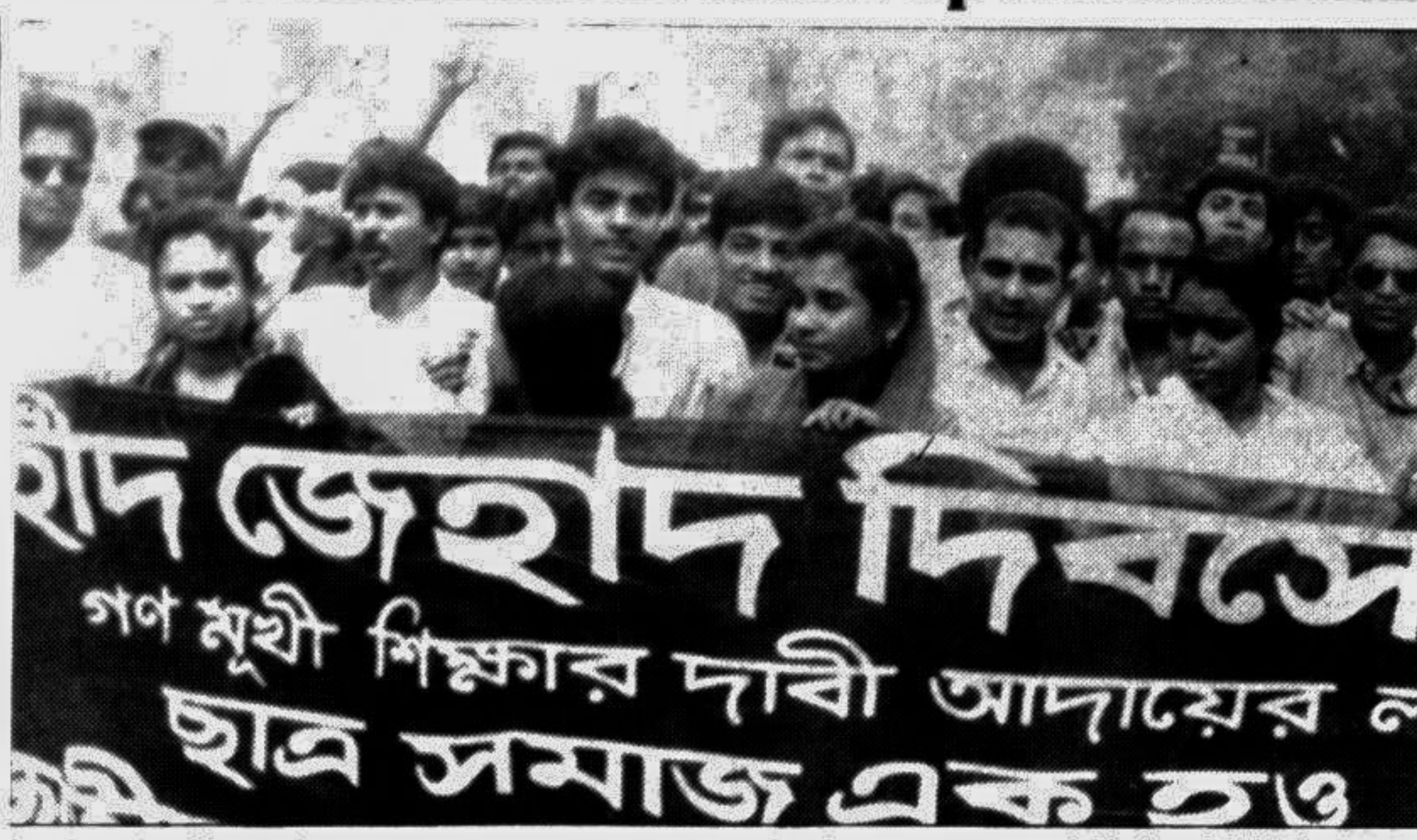
Students' rally in the city yesterday to mark the death anniversary of Shaheed Jihad.