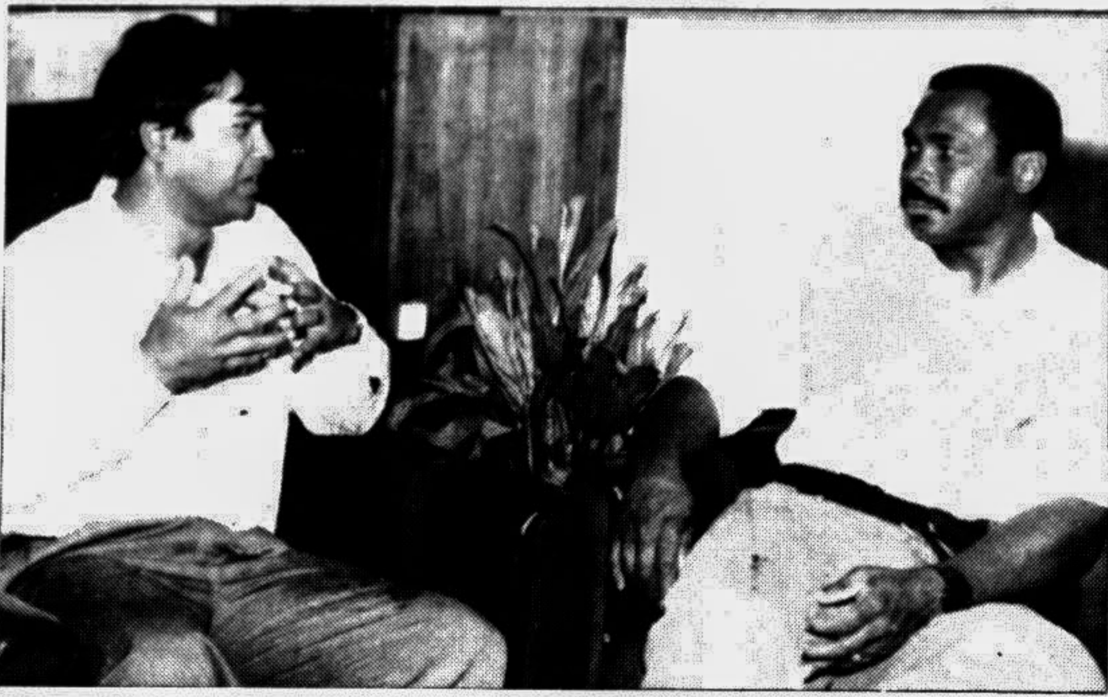
Former West Indies opener Gordon Greenidge (R), now in the capital to finalise his contract with the Bangladesh Cricket Control Board (BCCB) as future national coach, being conditioned on the new environment by the manager of the Bangladesh team Gazi Ashraf Hossain Lipu at the BCCB office yesterday.

In tomorrow's engagement Mohsin Club will take on Eastern Football Club at the same venue.