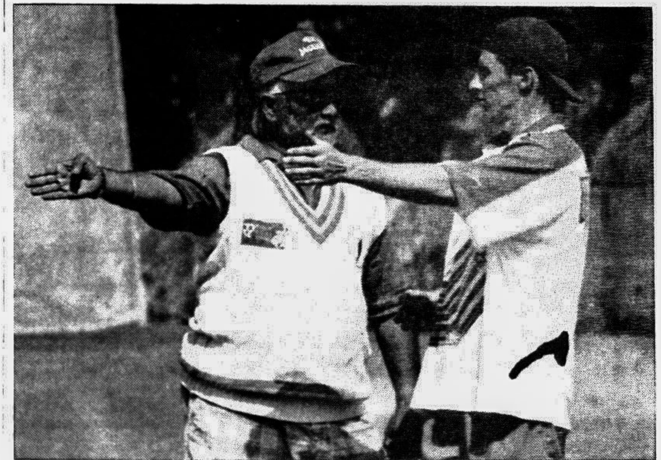
Legendary Indian spinner Bishen Singh Bedi (L) exchanges his views with Australian young spinner Brad Hogg during a practice session at the New Delhi National Stadium yesterday. The one-off Test between India and Australia begins at the Feroz Shah Kotla Ground today.

Umpires: Peter Willey (England) and Srinivas Venkatraghavan (India).