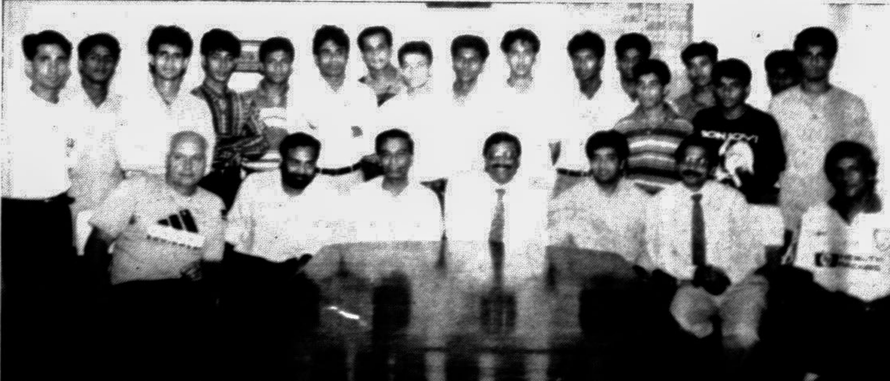
The under-19 football team which will participate in the Asian youth football championship in South Korea from October 17, called on State Minister for Youth and Sports Obaidul Kader at his office yesterday. The team will leave the country today.