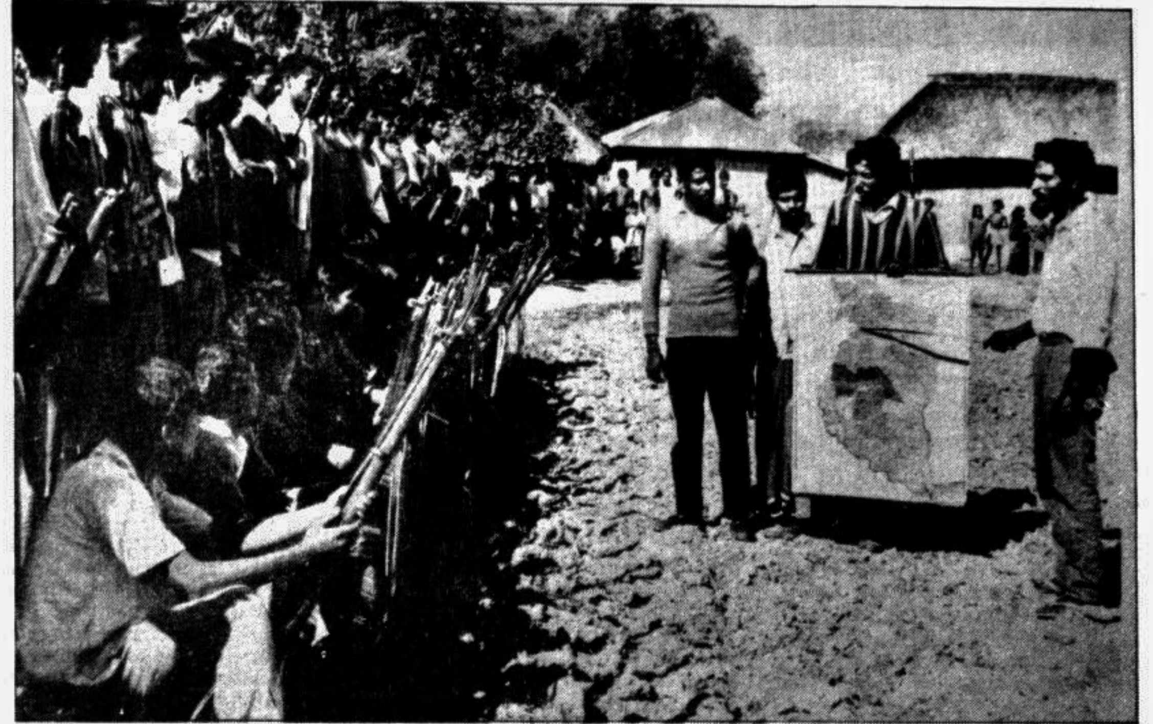
The Muktijuddha commander giving final instruction before his troop marches off to an operation somewhere in Hilli, Dinajpur. 5-7 May 1971.