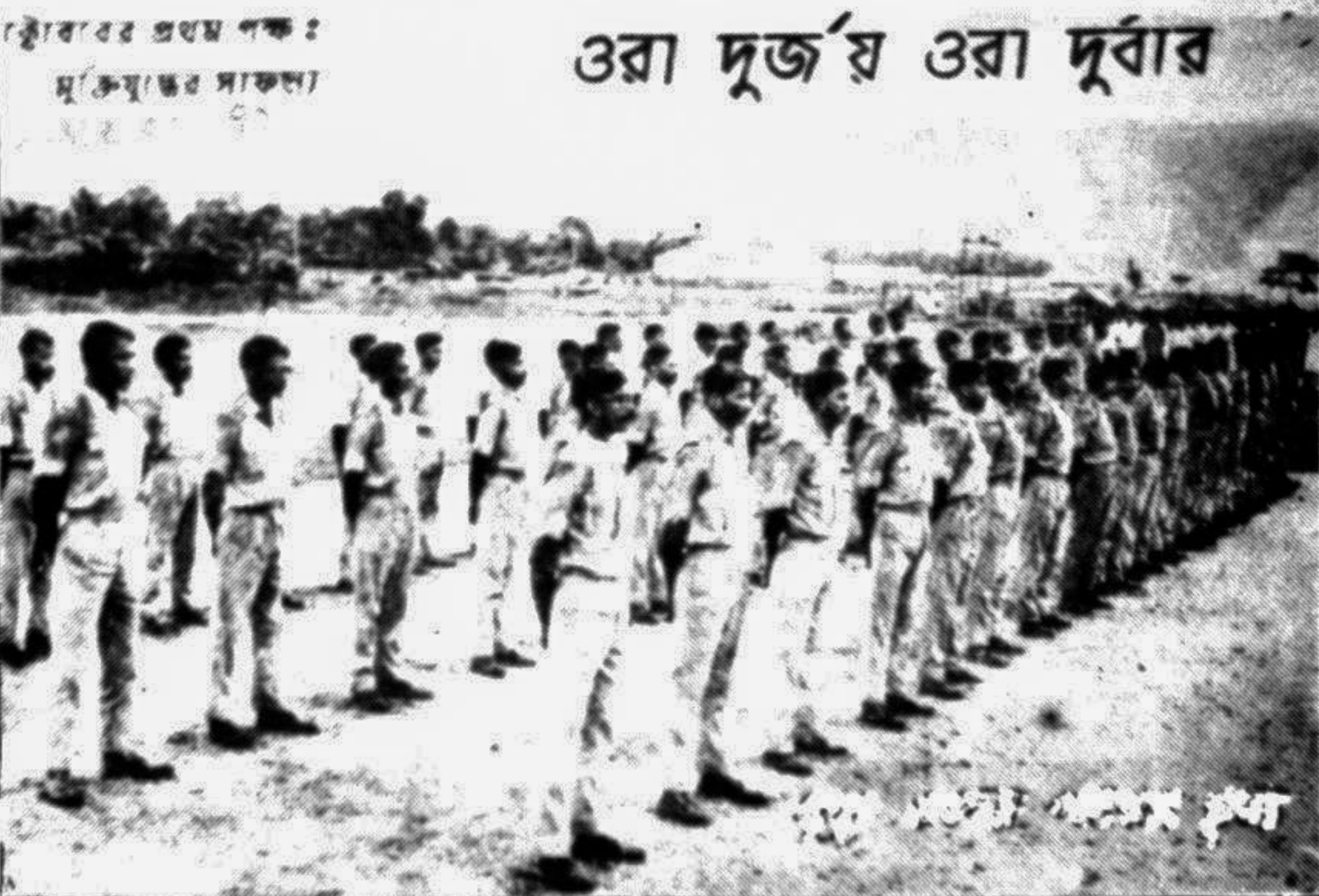
9th October 1971, passing out ceremony of First Bangladesh War Course during the war of liberation.

cadets for successfully completing the training and urged the newly commissioned officers to prove their worth in the battle field. He said the determinations he saw in these faces was refreshing and reassuring that Bangladesh shall be liberated in the near future. Immediately after the passing out all these officers were posted to take up assignments