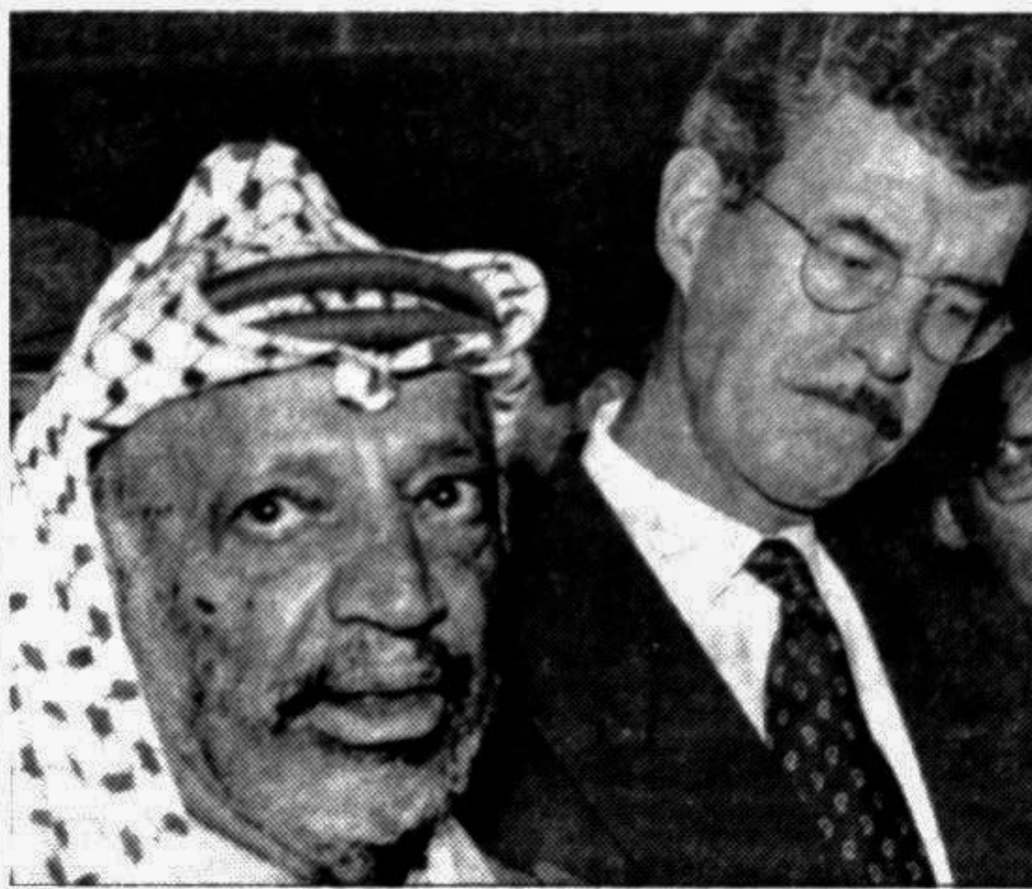
President of the Palestinian Authority Yasser Arafat (L) answers reporters' questions as President of the European Council and Irish Foreign Minister Dick Spring looks on during a short briefing at the end of their meeting in Gaza City yesterday.

In view of the upcoming mutual fund regulations that would allow floatation of mutual funds by banks and non-banking financial institutions, the mission stressed the need for levelling the playing field by removing ICB's privileges, specially the preemptive 15 per cent allocation to ICB of all public issues and ICB tax exemption.