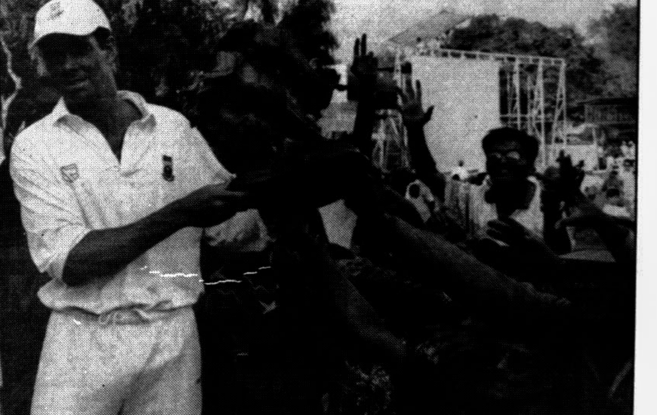
South African skipper Hansie Cronje poses with the trophy after winning the Kenyan Centenary four-nation cricket tournament in Nairobi on Oct 6.

Last year New South Wales' batsman Steve Waugh netted 140,000 dollars when he struck a straight six off Western Australia all-rounder Tom Moody at the WACA Ground in Perth.