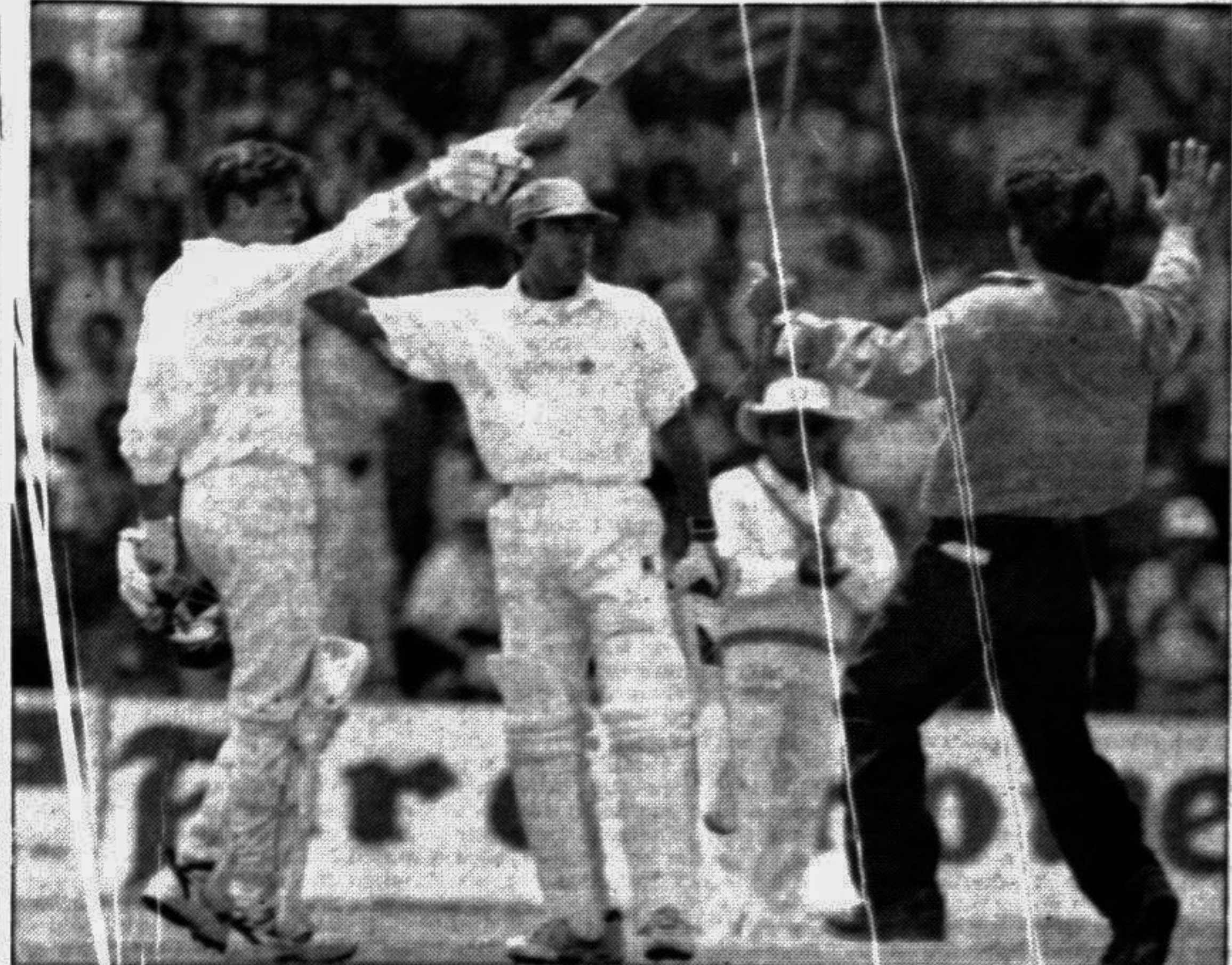
Pakistani batsman Shahid Khan Afridi (L) acknowledges the crowd's applause after scoring the fastest one-day century, while an overjoyed fan invades the field to greet the man of the moment in Nairobi, Kenya on Oct 4.