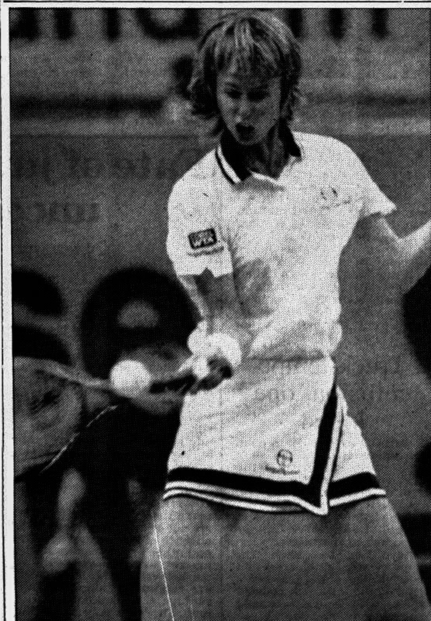
Helena Sukova of Czech Republic plays a forehand return against Spaniard Arantxa Sanchez-Vicario in the quarter-final match of the Leipzig Open in Germany on Oct 4. Sukova won 6-3, 7-6.

Today's Cryptquip clue: I equals W The Cryptquip is a substitution cipher in which one letter stands for another. If you think that X equals O, it will equal O throughout the puzzle. Single letters, short words and words using an apostrophe give you clues to locating vowels. Solution is by trial and error.