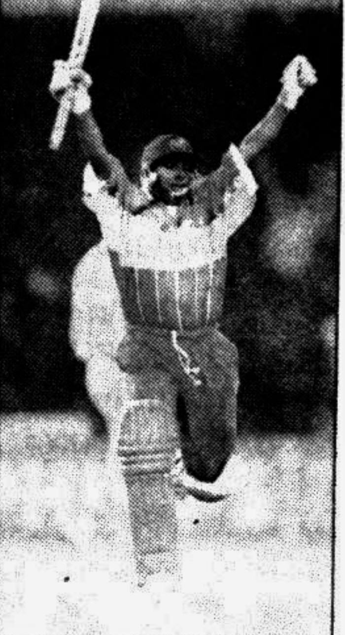
A DE SILVA ... 122

Waqar Younis wrapped it all up by bowling Chaminda Vaas — his fifth wicket — to seal a remarkable and unlikely victory for his team.