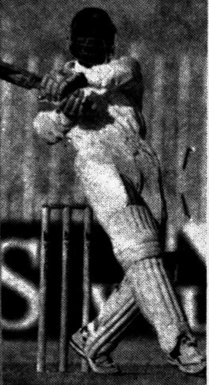
SAQEEED ANWAR ... 115

In their 50 overs and bowled Sri Lanka out for 289 in 49.5 overs. They will face South Africa in the final on Sunday.