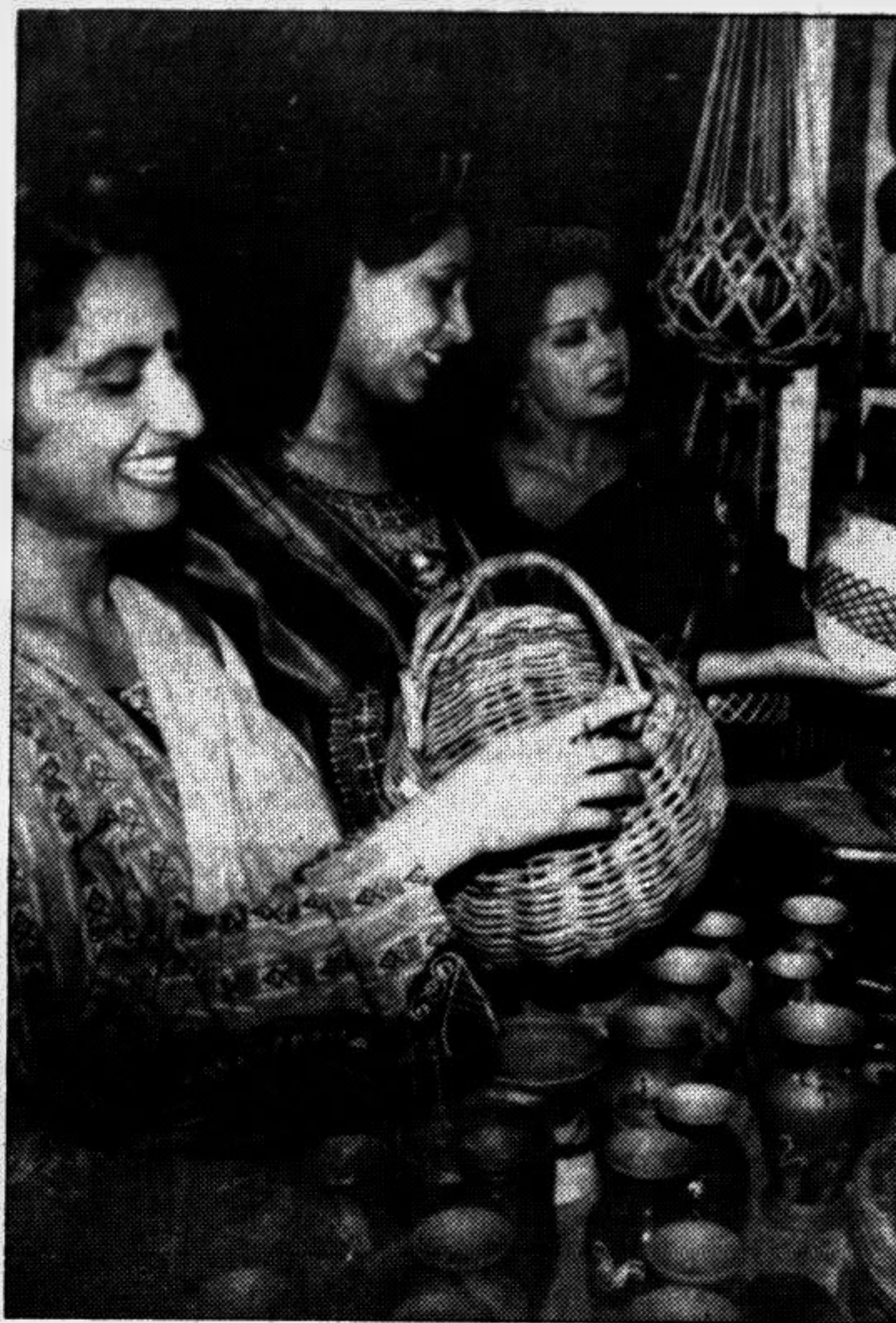
Visitors at the Dhaka Sheraton Hotel 'autumn mela' which opened at the hotel premises in the city yesterday.